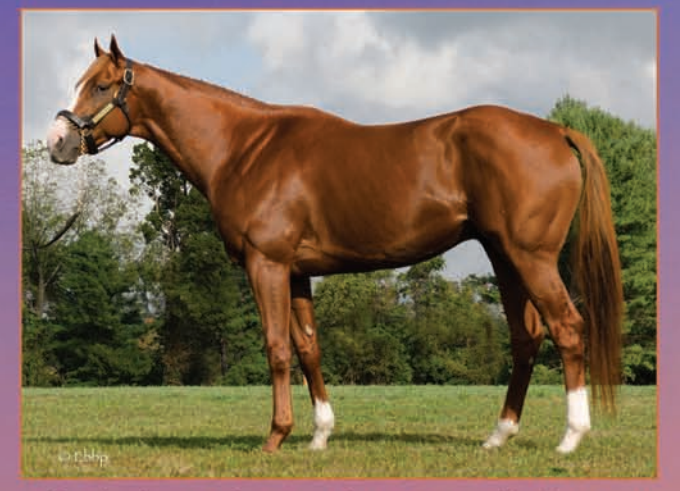
Mid-Atlantic's #1 First-Crop Sire & #1 Juvenile Sire In 2017 Malibu Moon – Bandstand, by Deputy Minister // $3,000 S&N