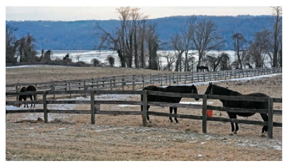
The farm ends at a sharp sloping cliffside that overlooks the Susquehanna River