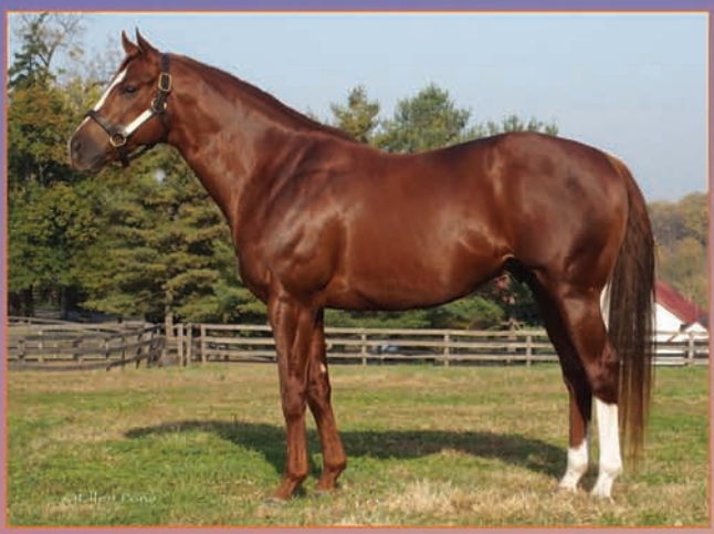
Maryland's Only Graded SW by PULPIT – Bred just like TAPIT Pulpit – Exogenetic, by Unbridled's Song // $3,000 S&N

Standing at Country Life Farm in Maryland