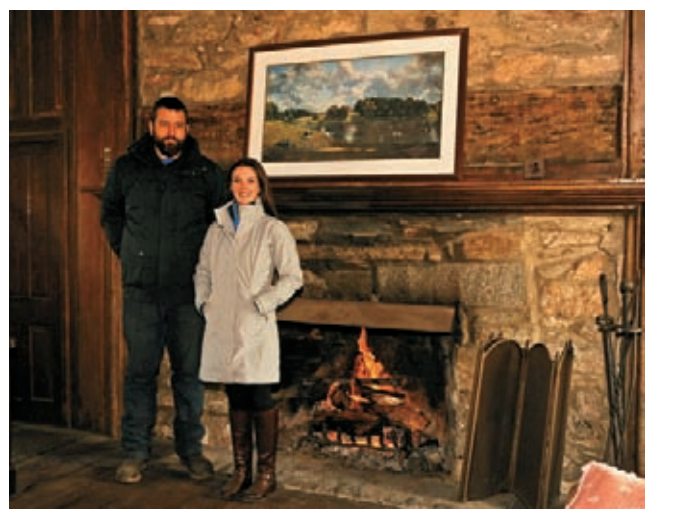
The core of the main house at Anchor and Hope is 400 years old

the area: "The old taproom, now the living room, with a large stone fireplace at each end, has a closet with a sliding panel that was once the ticket office for the stagecoaches and ferry. George Washington