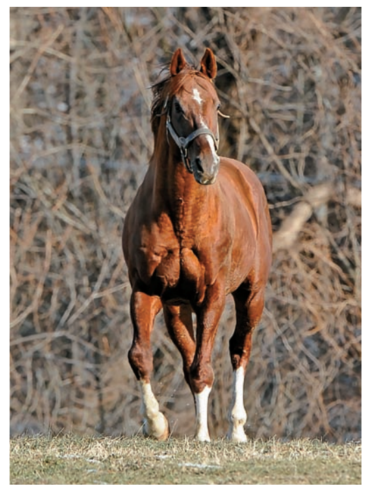
Imagining has top-class Maryland connections