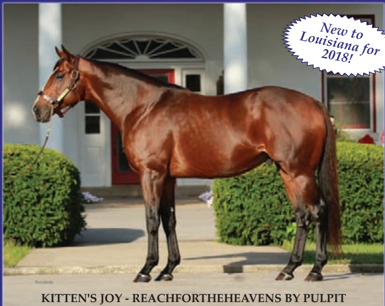
KITTEN'S JOY - REACHFORTHEHEAVENS BY PULPIT

2 TIME GRADE 1 WINNER AND MILLIONAIRE BY CHAMPION SIRE KITTEN'S JOY WINNER OF THE $1 MILLION G1 MANHATTAN WINNER OF THE $1 MILLION G1 ARLINGTON MILLION