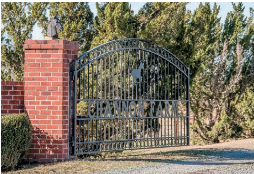
The entrance to the 86-acre Channon Farm