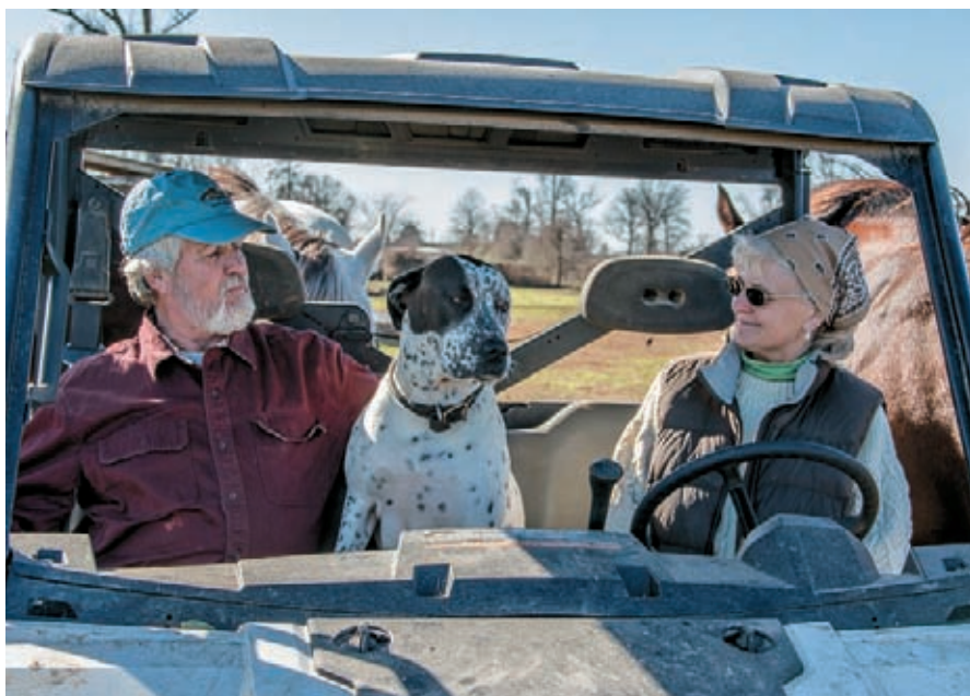
The Taylors with one of their three mixed-breed hounds

Gary McMillen is a freelance writer based in New Orleans.