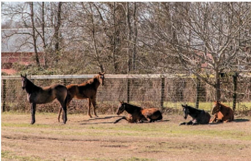
Channon Farm contains 18 paddocks that vary in size from a half-acre to 10 acres

The physical layout of Channon Farm contains 18 paddocks that vary in size from a half-acre to 10 acres; 42 stalls; four large foaling stalls; and a 50-acre meadow exclusively for broodmares. An-