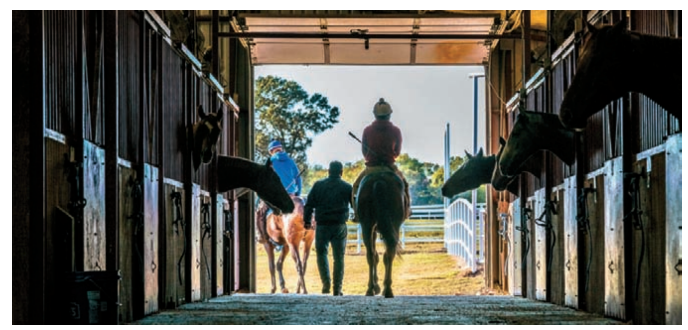
Highlander Training Center features a 29-stall barn; a 32-stall barn is in the works

The 2009 Horse of the Year got her start