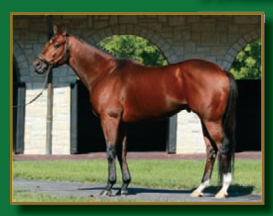
DEN'S LEGACY (Medaglia d'Oro-Sunshine Song, by War Chant)

A Grade 1-placed and Grade 3 winner By the sire of KY Derby hopefuls BOLT D'ORO and ENTICED