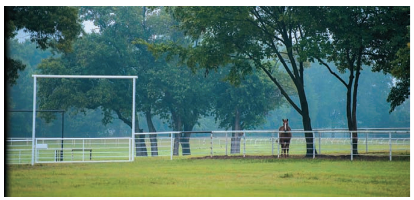
The capacity at Highlander Training Center will be 110-120 by September

"Everything we looked at suggested that to have a total training facility we should have a therapy center, so we'll have a resistance pool and vibrating plates. We don't have an absolute date on that yet as we are