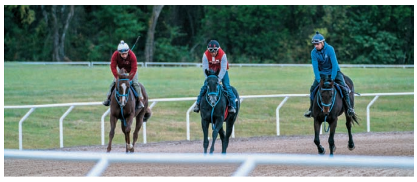
Horses take to the track at Highlander Training Center, which is near Sulphur Springs, Texas