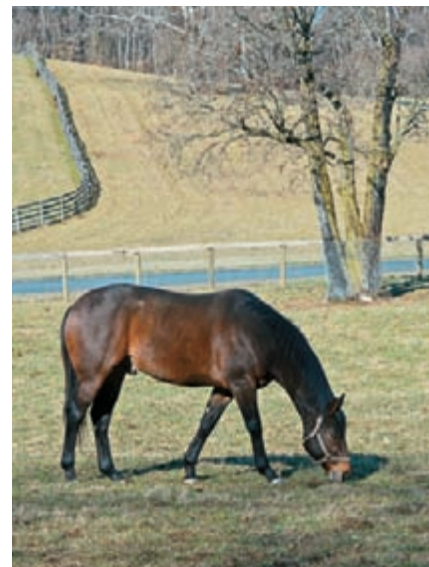
Two of the three new stallions for the Maryland market at Bonita Farm: Dortmund, left, and Alliance