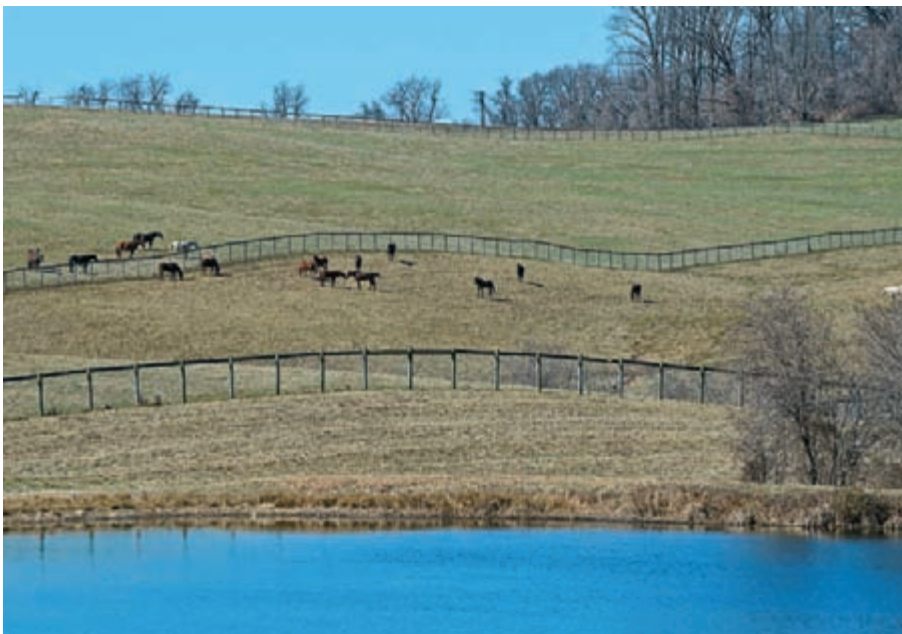
At 400 acres, Bonita Farm has room for training—even jumpers—and the broodmare band

And the memories keep mounting at Bonita Farm. BH