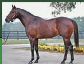
Sing Baby Sing