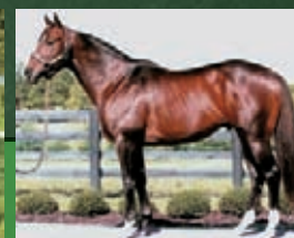
Woke Up Dreamin