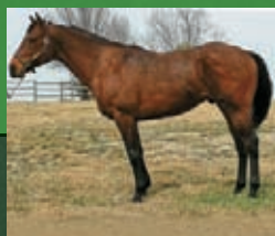
My Italian Ex