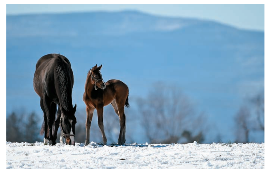
Mare and foal at Sequel New York