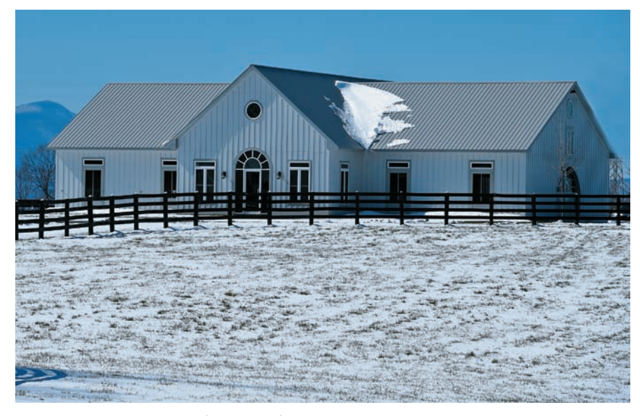
Sequel has undergone a major renovation

Established in 2000, Sequel underwent a major renovation in 2012, a year after