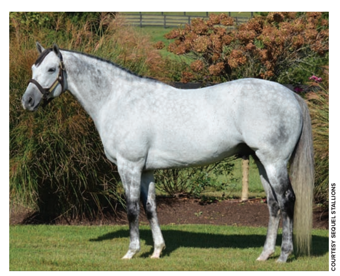
Perpetual leading New York stallion Freud, left, and graded stakes winner Mission Impazible