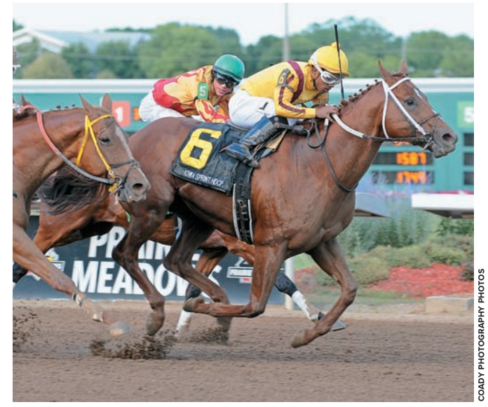
Union Jackson winning the Sam Houston Sprint Cup and the Iowa Sprint Handicap