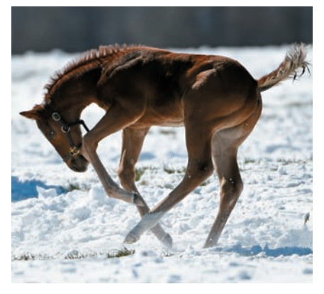
Foal plays in the snow

"Freud's done it all," she said. "It doesn't matter whether his offspring run in re-