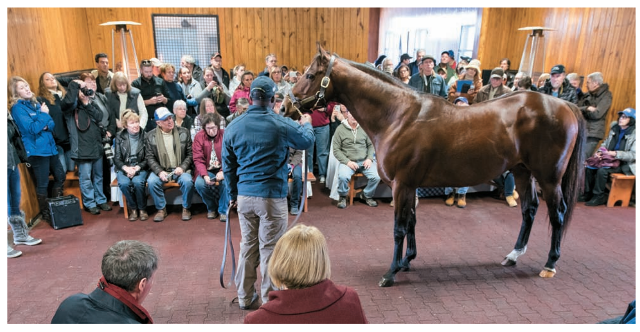
Alpha being presented at a stallion show for Sequel Stallions in upstate New York