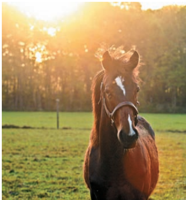
A yearling turned out in a spacious Blue Star paddock

“I’m proud to be in this part of Louisiana,” he said, sitting on an upturned feed bucket.