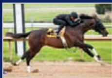
A Texas-bred colt by Grasshopper sold for $120,000!

NOW TAKING ENTRIES FOR THE TEXAS SUMMER YEARLING AND MIXED SALE!