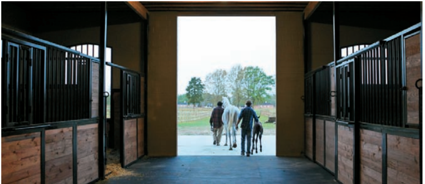
Broodmare and foal go out for exercise

program was the March Ocala Breeders' Sales 2-year-olds in training sale. A pair of colts sired by Real Solution sold for a combined $1 million.