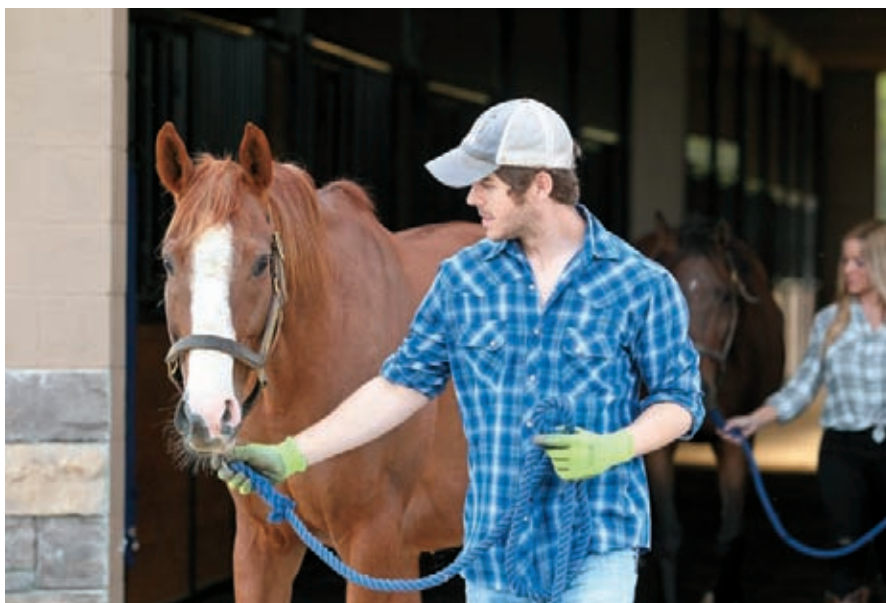
The Comardelles lead broodmares out to their paddock