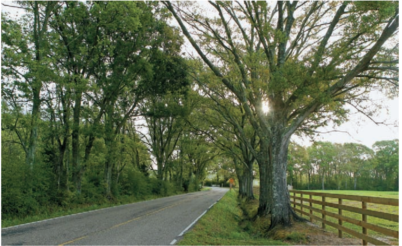
Blue Star Farm is in a beautiful, secluded area outside Scott, La.

of the fabric is dedication to customer service.