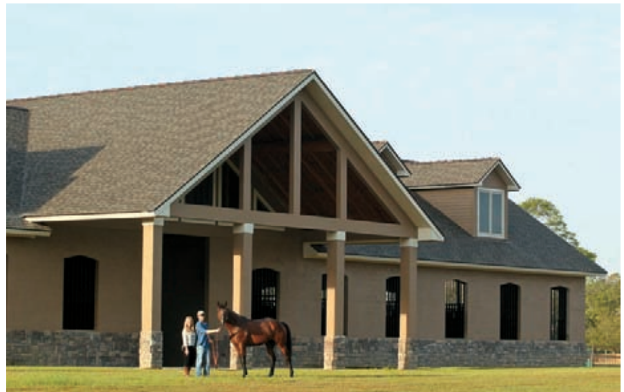
Multiple grade 1 winner Real Solution stands at Blue Star; right, in front of the farm's main barn