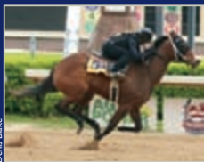
A Louisiana-bred filly by Bind sold for $140,000!

FOUR HORSES SOLD FOR $100,000 OR MORE, INCLUDING A TEXAS-BRED AND A LOUISIANA-BRED!