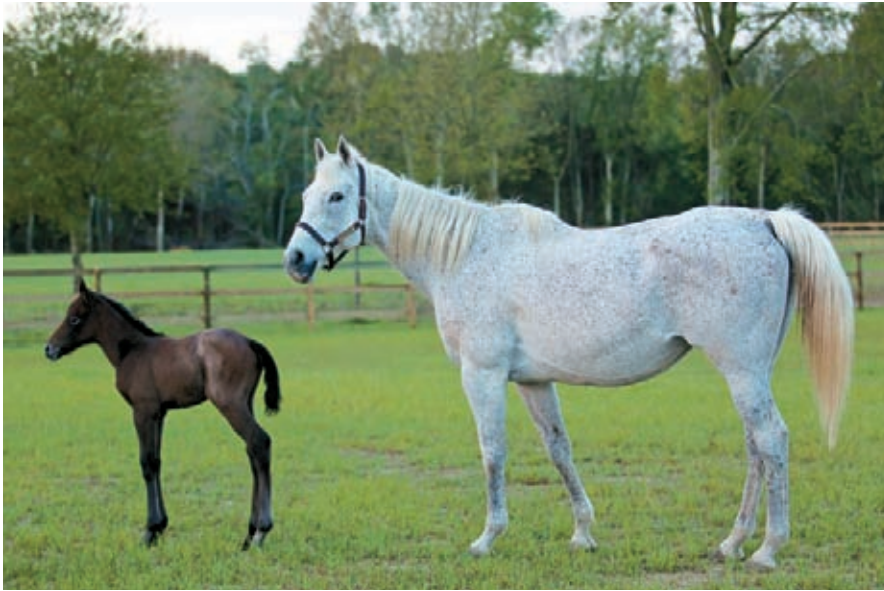
First-class care and attention are hallmarks of Blue Star