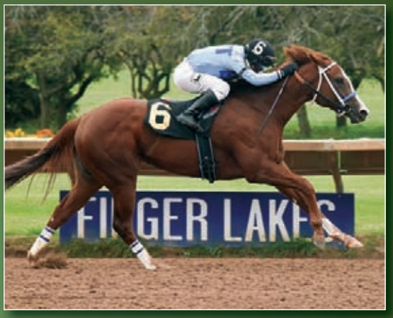
Sire of multiple stakes winner SASSY AGNES ($113,182, 1st Shesastonecoldfox S. Lady Finger S.)