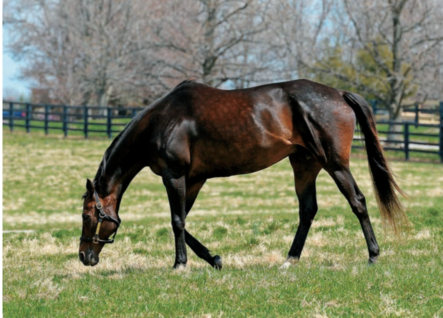
Time outside is important to allow a horse to “be a horse”

While the Fitzsimonses have run Oak Lodge for a decade, they had years of dedicated service to the industry under their