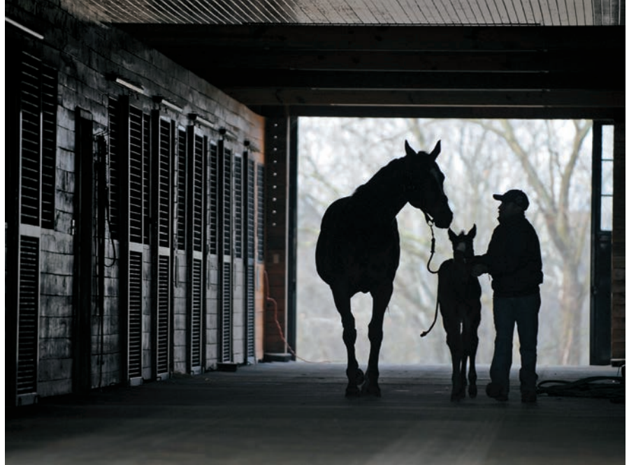
The staff, and how they handle horses, is a key component to a top-level operation

When you are driving through Millennium Farms, it’s hard not to notice how lush and healthy the pastures stay throughout the growing season. Farm management works with local extension agents to test the pastures regularly, ensuring horses receive the optimum vitamin and mineral content from their forage.