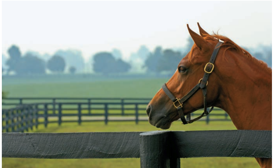
Some clients, and most horses, prefer plenty of space and large paddocks