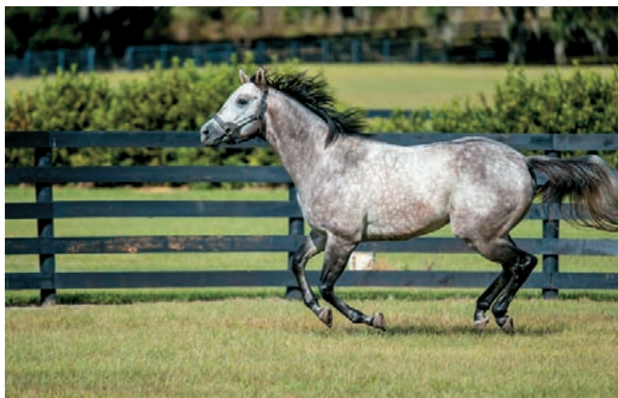
Wait, by Distorted Humor out of Wait a While, will stand his first season at stud in 2019