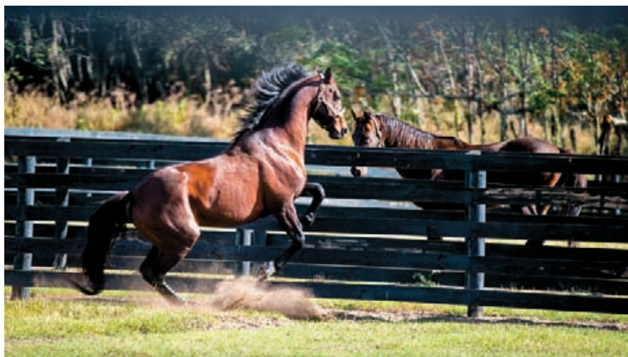
Brethren, the sire of Cookie Dough, ranks seventh on the Florida general sires list

Wait's 2019 live foal fee is listed as $2,500. Brethren, a son of Distorted Humor and half brother to 2010 Kentucky Derby winner Super Saver, stands at Arindel for $7,500. The bay horse, bred