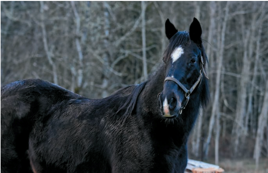
Our Monstarr is the dam of stakes winner Money Inthe Starrs