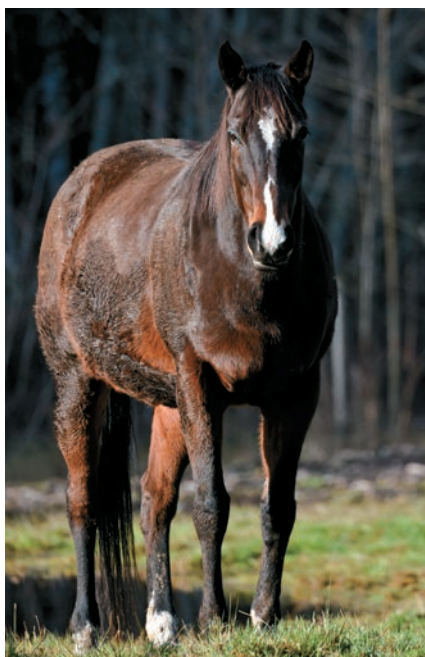
Great Mom has produced two stakes winners, including 2018 star This Great Nation

that doesn’t ship well, Belshay has chosen to breed her locally while sending Our Monstarr to California to be bred. So Great Mom has a newly turned yearling filly by Blue Ribbon stallion Atta Boy Roy while Our Monstarr has a yearling colt by Grazen (a son of Benchmark standing at Tommy Town Thoroughbreds).