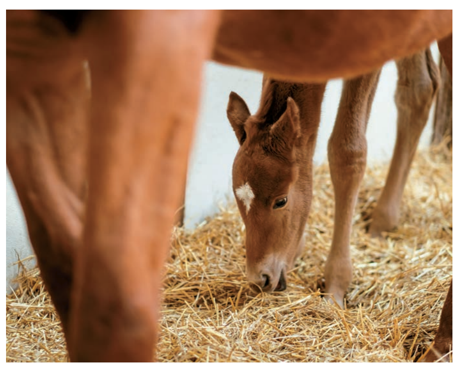
The Jockey Club reports there were 222 Minnesota-bred foals in 2016

"It's wonderful for the foals. It can be zero outside, and those foals are curled up comfy like big, old dogs. They sleep in the sunshine like they were down in Florida, and we've had no problems with pneumonia or sickness."