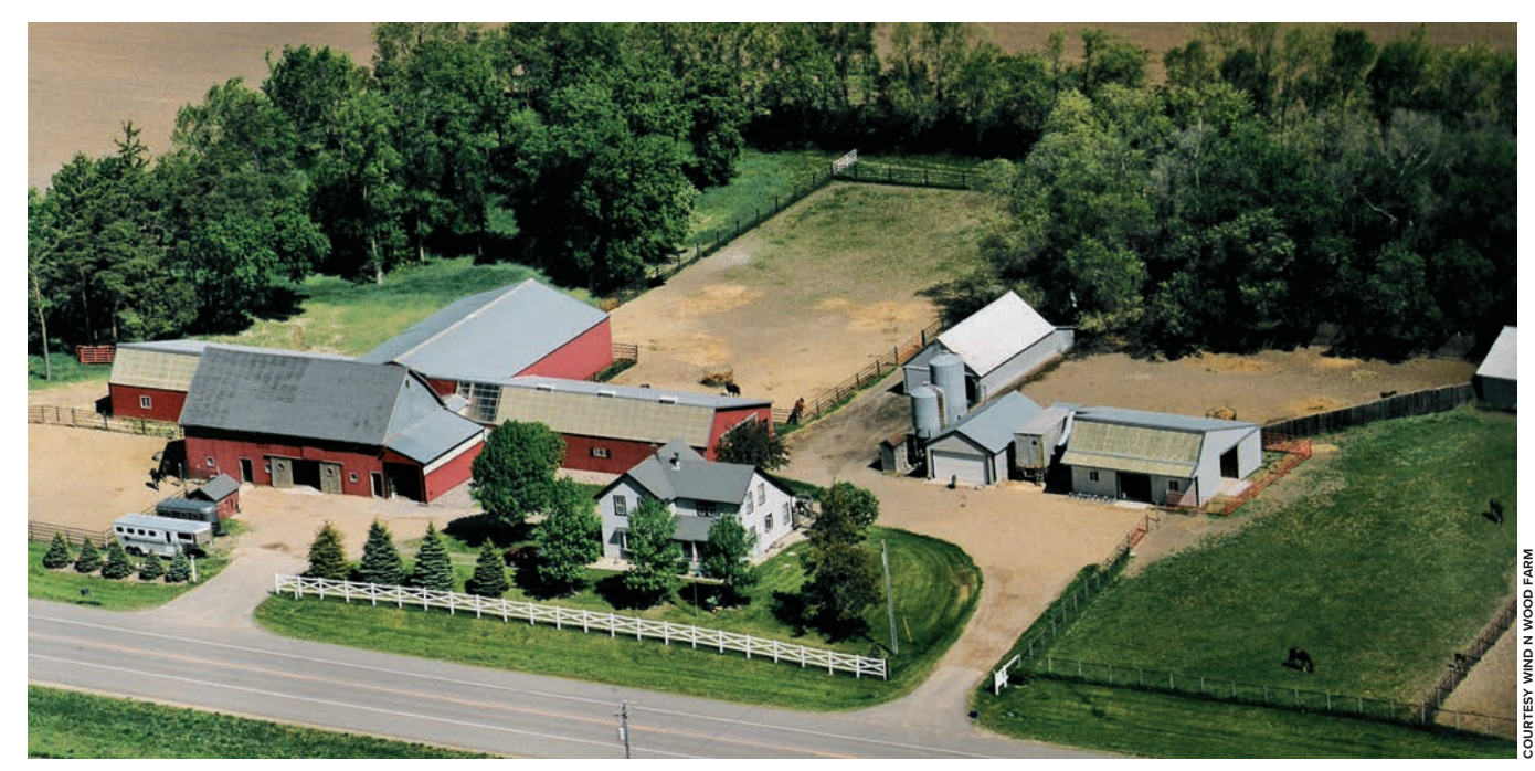
Wind-N-Wood Farm is 50 acres and about a 50-minute drive from Canterbury Park

Wind-N-Wood bred and raised the Scrimshaw colt Nomorewineforeddie, whom it sold for $4,700 at the 2007 Keeneland September yearling sale. Nomorewineforeddie won three consecutive editions (2010-12) of the Canterbury Park Sprint Championship Stakes and earned $226,419. Wind-N-Wood also raised the Monarchos gelding A P Is