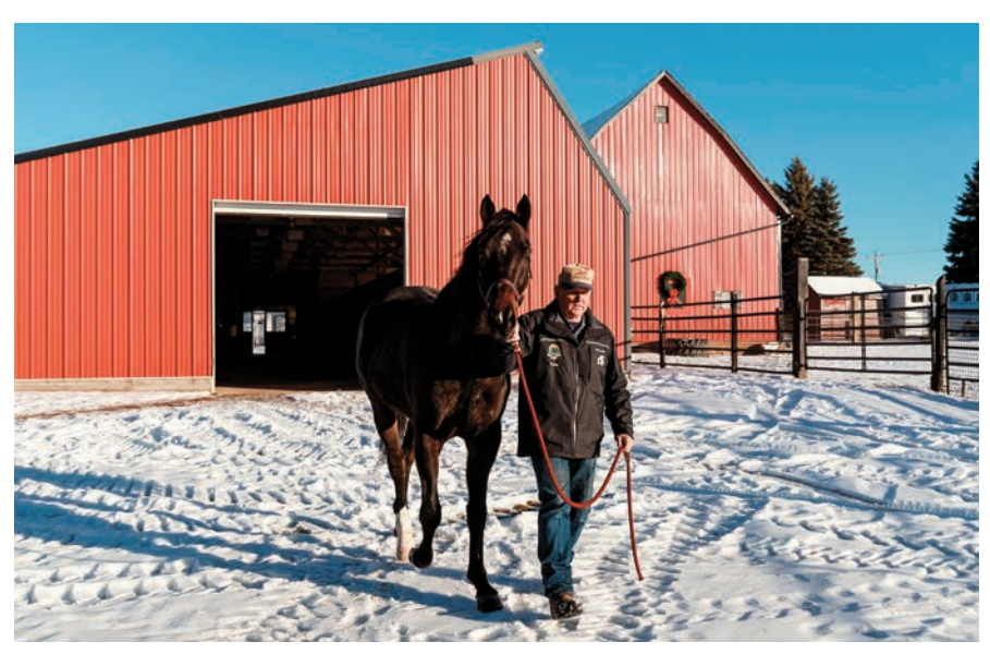
Wind-N-Wood is the largest foaling facility in Minnesota