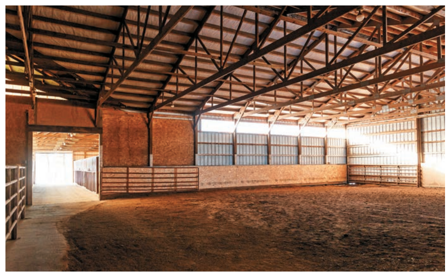
Solar-powered barn has a roof at a sharp angle, allowing the barn to capture sunlight in winter that can make the area 30-40 degrees warmer than the outside temperature