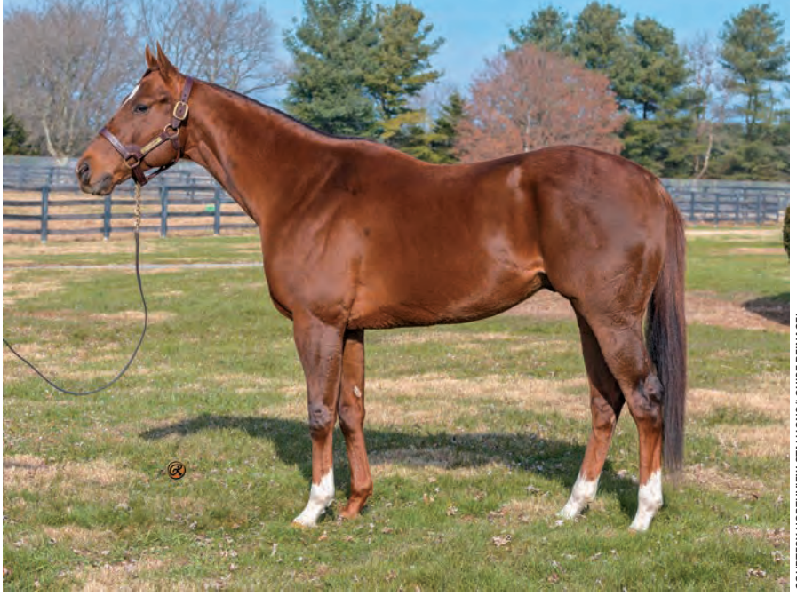
Irish War Cry, by Curlin, won the grade 2 Holy Bull and Wood Memorial

Weekend Hideaway (Speightstown—Apocalyptical, by Wiseman's Ferry) will stand at Irish Hill & Dutchess Views Stallions near Stillwater, N.Y., for $2,500. The 9-year-old was quick enough to be named champion New York-bred 2-year-old male and durable enough to go 13-7-10 in 49 starts, winning nine stakes and placing in the grade 1 Vosburgh Stakes.