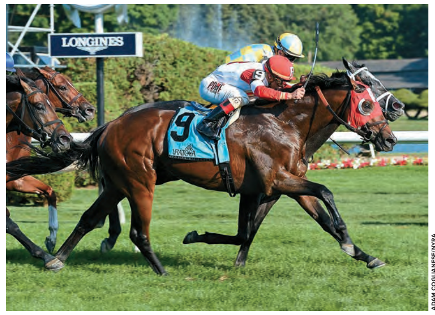
Camelot Kitten is the first son of Kitten's Joy to stand in New York

foal crop is way down. The numbers that we've all seen suggest a relatively small, select group of stallions is getting the lion's share of mares. That's concerning in the long run. There are some people up here that are breeding and buying to race, and the Maryland stallion farms need to focus on those people.