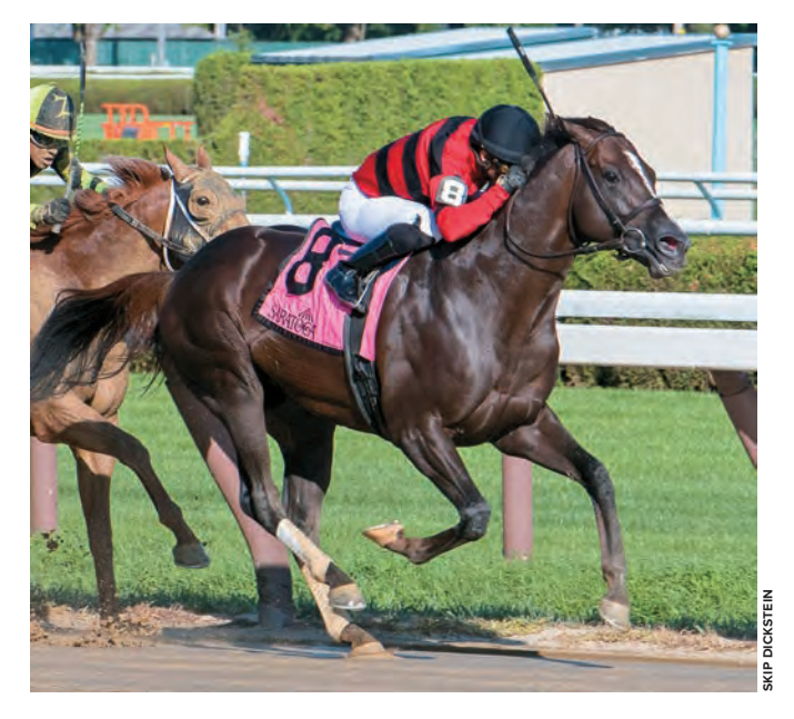
Weekend Hideaway, by Speightstown, went 13-7-10 in 49 starts

"All three New York Racing Association tracks have two turf courses, and they