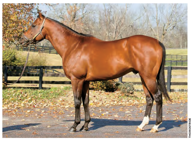
Redesdale is out of a full sister to the breed-shaping Danehill

"Having participated in the New York program for a while now, and having