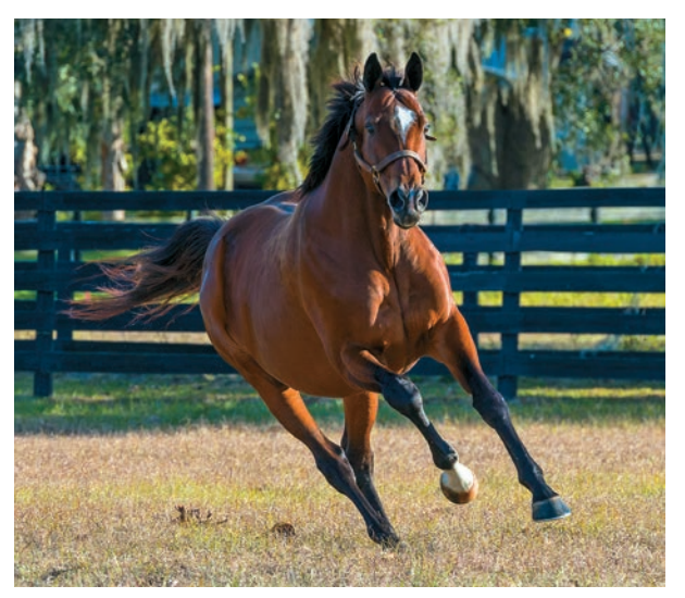
Grade 3 winner Irish Surf, a son of Giant's Causeway, stands at Ocala Jockey Club for $5,000