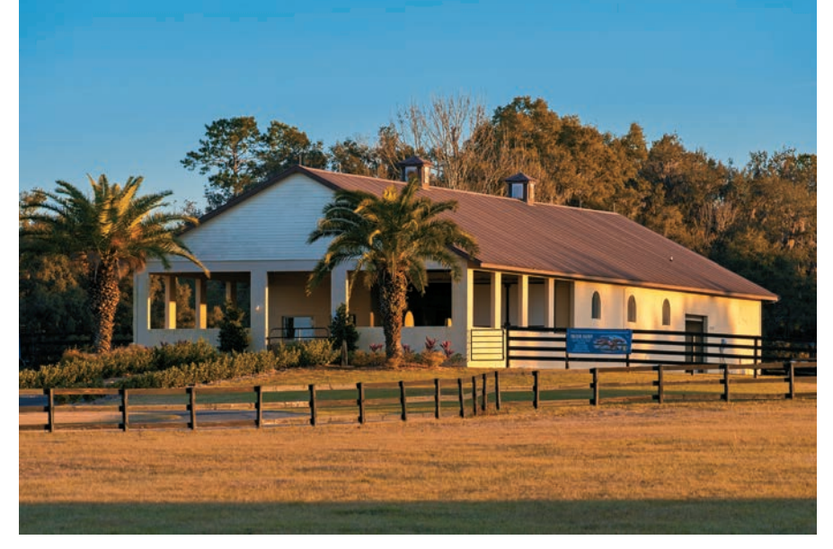
The stallion barn at Ocala Jockey Club

The 2018 event was one of just five in the United States and the only one in the Southeast to have the prestigious CCI3 division. This attracts top-level riders because it's one of the few places where they can qualify for events such as the Olympics or the World Equestrian Games. A total of 135 starters entered the event last November.