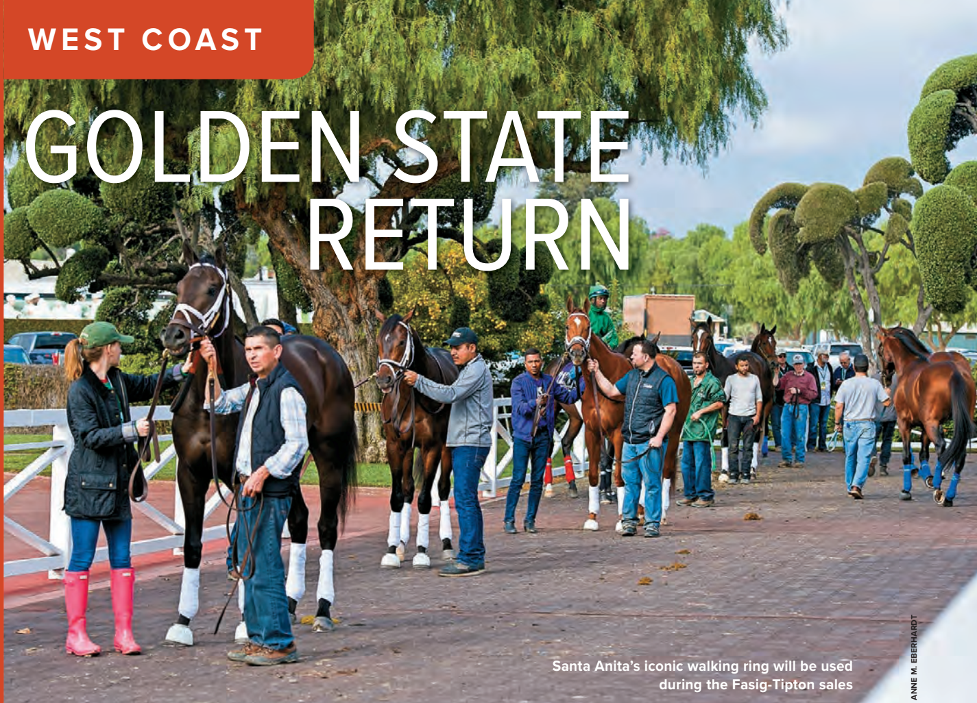
Santa Anita's iconic walking ring will be used during the Fasig-Tipton sales

CALIFORNIA IDAHO NEVADA OREGON UTAH WASHINGTON WYOMING