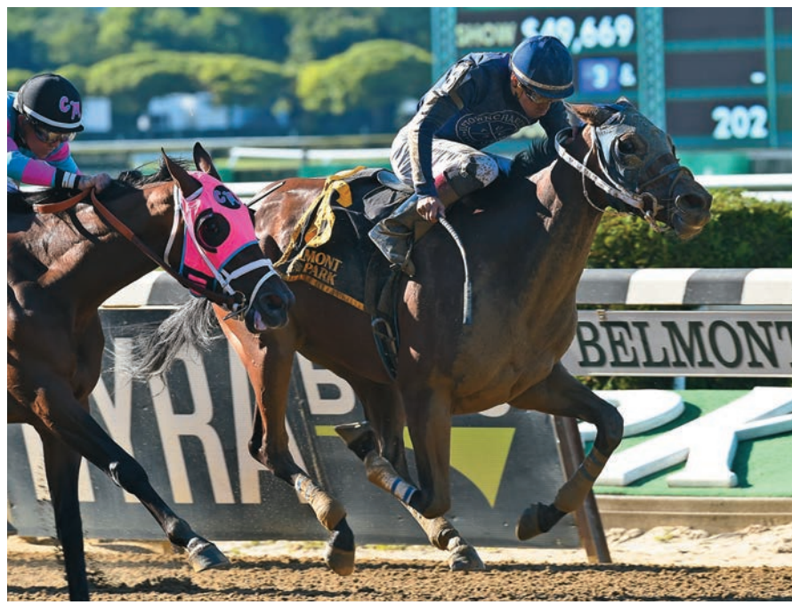
Dixie Serenade winning the Victory Ride Stakes

all the progeny of the son of Limehouse—La Illuminada, by Langfuhr. That will be changing rapidly, though, given the success Charly’s progeny are having on the racetrack, particularly his Pennsylvania-