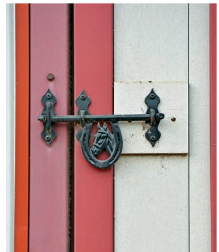
Diamond B Farm is on the upswing in Pennsylvania