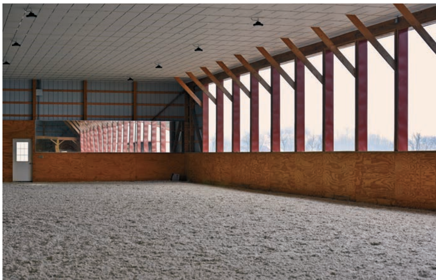
The indoor arena at Diamond B Farm