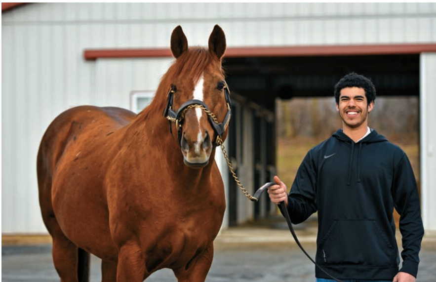
Uptowncharlybrown became the leading third-crop sire in Pennsylvania last year