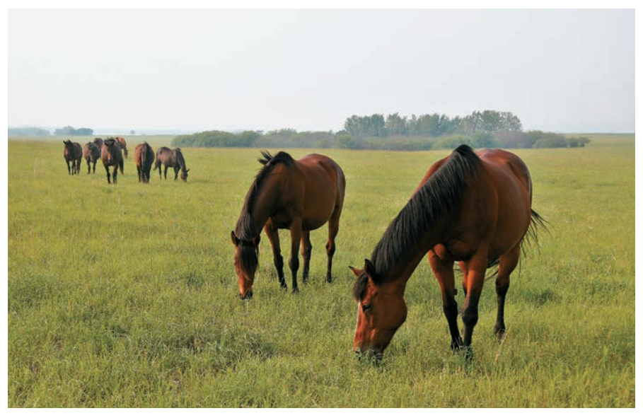
Some of Esquirol's 26 broodmares

"I have most of the yearlings that I bought back in training now, but they are for sale. I don't race horses. If I did, I would