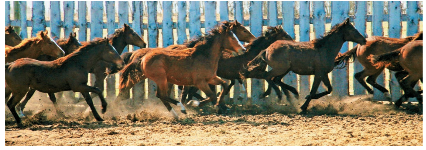
Esquirol is breeding to name-brand U.S. stallions