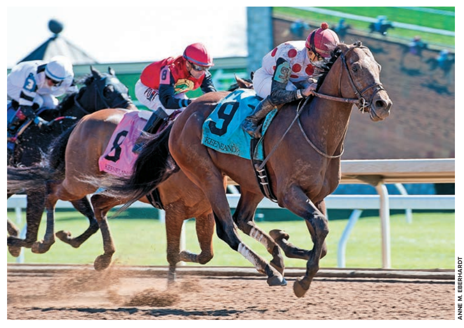
Awesome Slew winning the seven-furlong Commonwealth Stakes (G3) at Keeneland

young stallions are really popular, and there is strong demand for some of them.