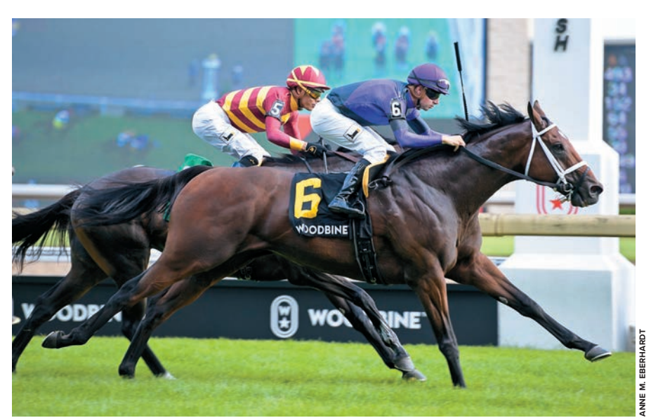
Grade 1 winner Long On Value made 32 starts

Long On Value (Value Plus—Long Message, by Orientate) had a long career on the track. He made 32 starts in six seasons in training and was much more successful as he got older.