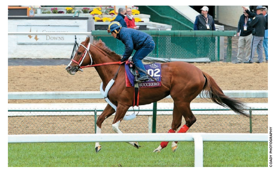
Turf sprint star Bucchero, by Kantharos, stands at Pleasant Acres Stallions