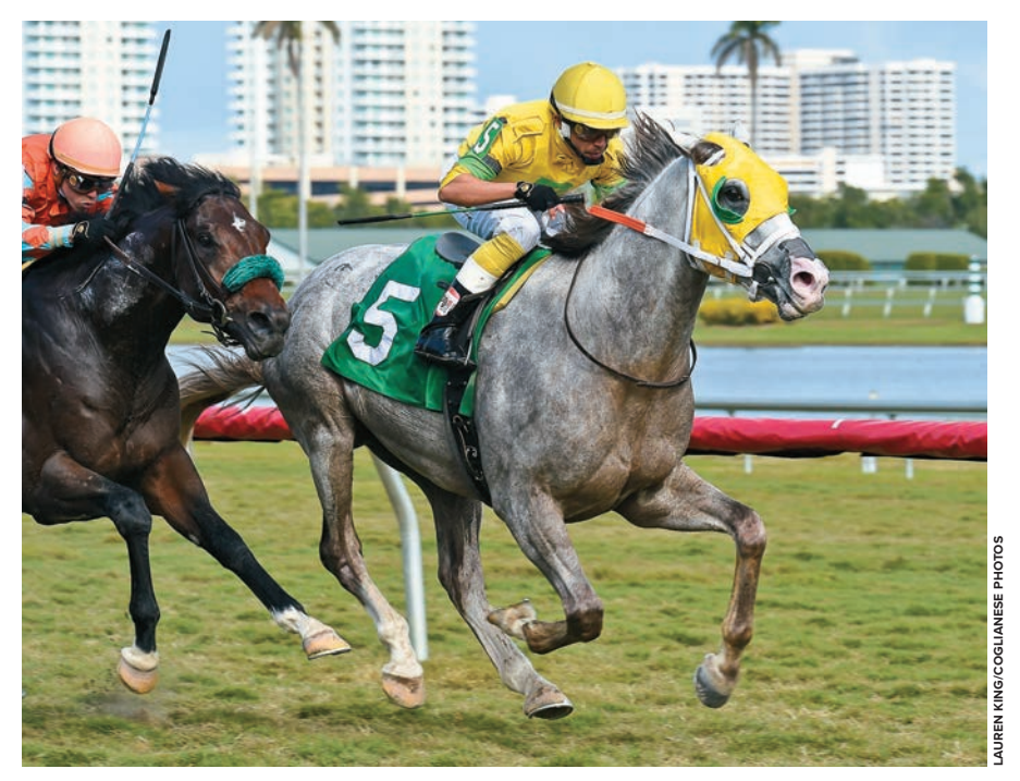
Shades of Night, by General Quarters, stands at Stonewall's Prestige Stallions

A winner of Santa Anita's Twilight Derby (G2T) on the Breeders' Cup undercard in 2014, he later traveled to Dubai to run second in the Al Quoz Sprint Sponsored by Azizi Developments and capped his racing days with a third-place effort in the Ricoh Woodbine Mile Stakes (G1T) and a win in Woodbine's Highlander Stakes (G1T).