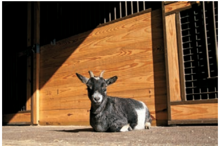
A barn pet at Cedar Run Farm