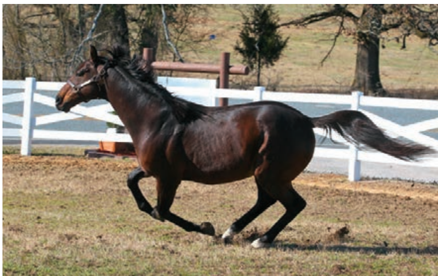
Grade 1 winner and Cedar Run stallion Moonshine Mullin tears through his paddock