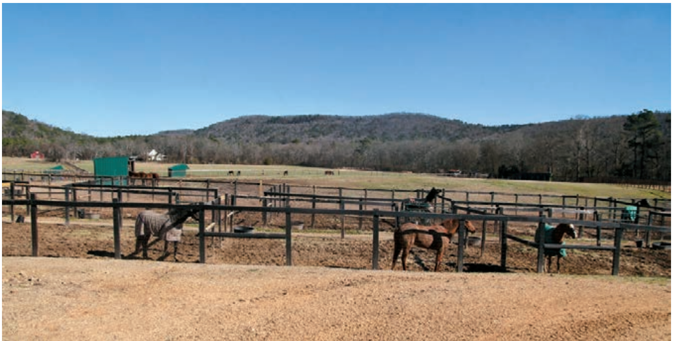
After starting with just 40 acres, the land at Cedar Run Farm has now been expanded to around 200 acres