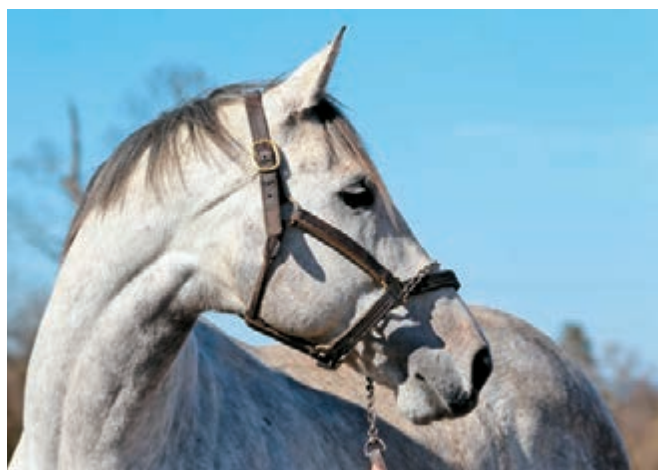
Street Strategy stands at Cedar Run Farm