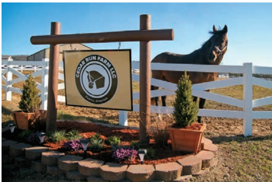
Cedar Run Farm has been built from scratch