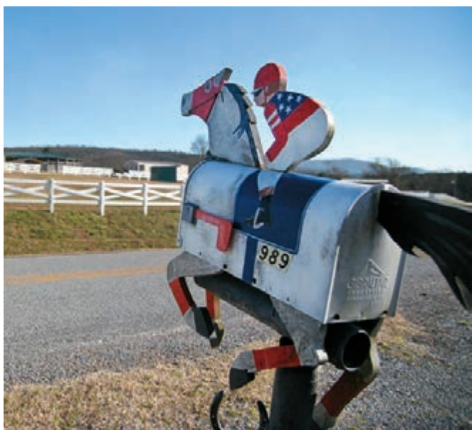
Sporting colors adorn the mailbox at Cedar Run Farm