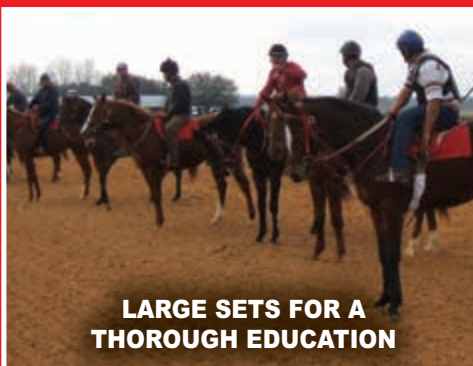
LARGE SETS FOR A THOROUGH EDUCATION