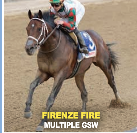
FIRENZE FIRE MULTIPLE GSW