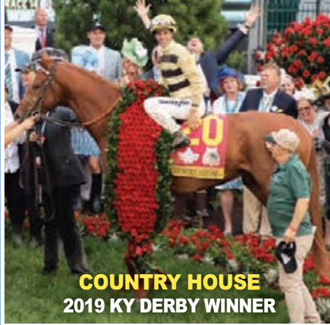
COUNTRY HOUSE 2019 KY DERBY WINNER