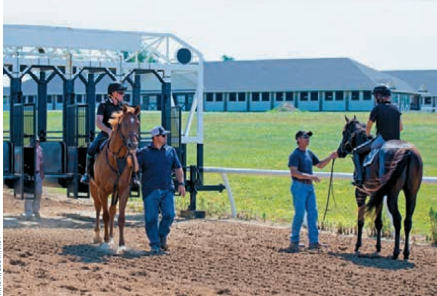
Learning how to break from the starting gate is a key element of getting to the races

The training center features state-of-the-art racing surfaces and facilities,