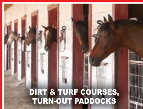
DIRT & TURF COURSES, TURN-OUT PADDOCKS

A job well done, a name you can rely on.