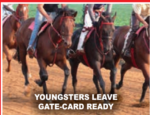
YOUNGSTERS LEAVE GATE-CARD READY

push them unnecessarily. That's horsemanship. And when it comes down to it, that is the secret to our success. Our young Thoroughbreds are allowed to develop at their own pace. While many of our graduates enjoy early success, all of them are handled with the long haul in mind, most of which have a long career lasting many seasons.