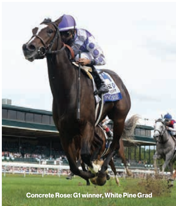
Concrete Rose: G1 winner, White Pine Grad