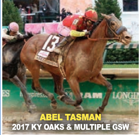
ABEL TASMAN 2017 KY OAKS & MULTIPLE GSW