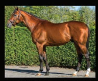
GSW/G1P by MEDAGLIA D'ORO MICROMANAGE

Co-Leading New York Sire by 2YO Winners $4,000 LFSN