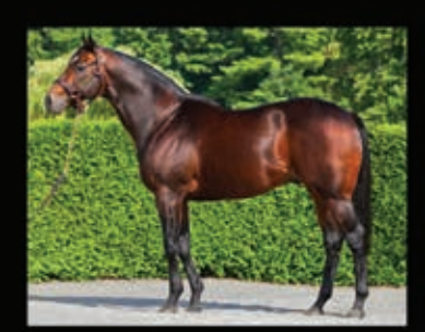
Leading Sire by GIANT'S CAUSEWAY GIANT SURPRISE

Multiple Graded SW/G1-Placed $5,000 LFSN