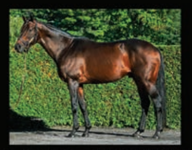
Grade 1 SW by FOREST WILDCAT A SHIN FORWARD

3rd All-Time Leading NY-Bred $3,500 LFSN