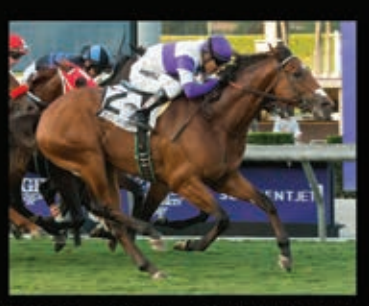
Multiple GSW by QUALITY ROAD FRANK CONVERSATION

3rd All-Time Leading NY-Bred $3,500 LFSN