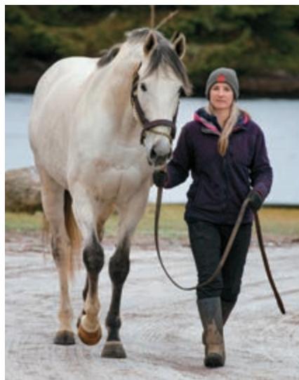
Shannondoe stallion Conquest Curlinate, a son of top sire Curlin

"We all know the scrutiny we are under in the public eye with all these breakdowns," she said. "I believe it's because horses aren't raised to be tough anymore, and they need that bone density. Instead of letting them run in paddocks and rough-