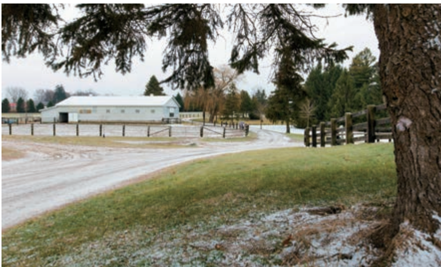
Shannondoe Farm encompasses 60 picturesque acres