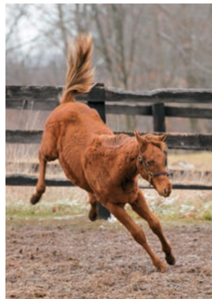
A youngster is feeling good at Shannondoe Farm

Stallion Season Auction and Associated Stakes Race details at www.ITOBA.com • 317-709-1100 • info@itoba.com