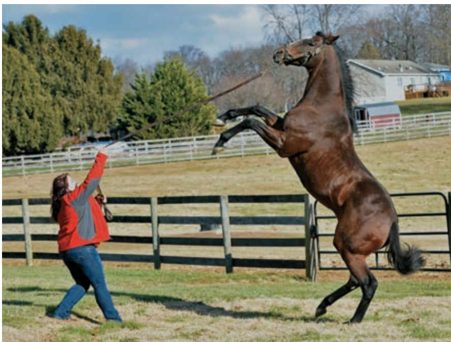
Nineteen-year-old Weigelia ranked sixth on the 2019 Pennsylvania leading sires list

"It's wonderful to breed in Pennsylvania. The number of race days, the breeder program, and the breeder bonuses. The stallion bonuses. We were lucky to catch a