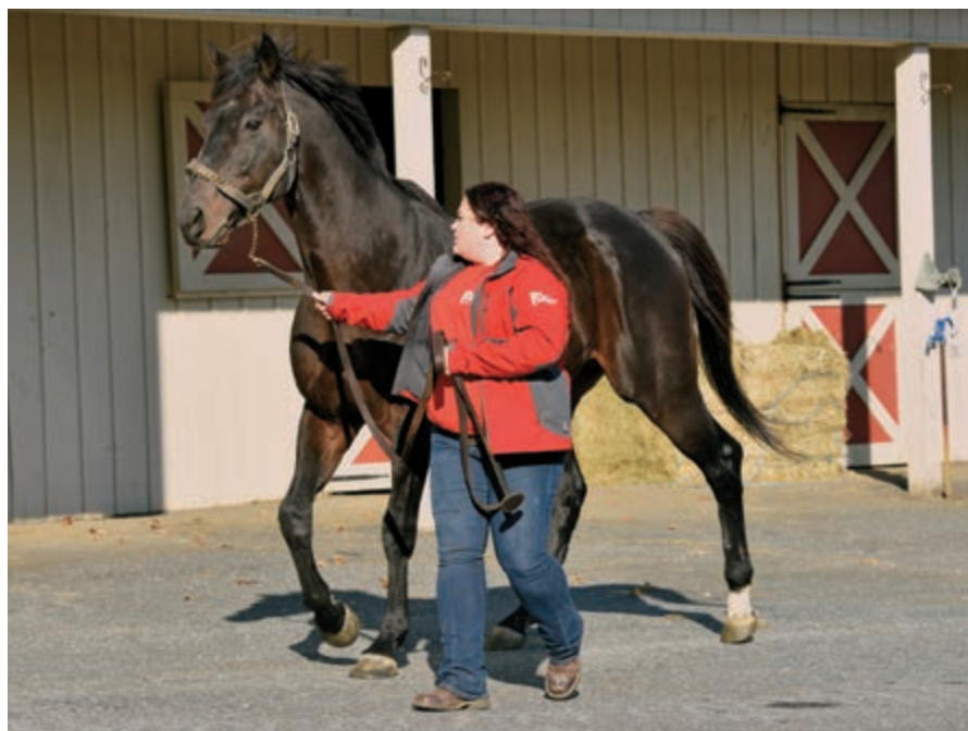
Warrior's Reward's initial book at WynOaks was filled with 140 mares