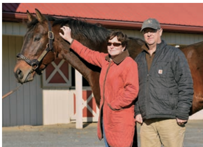
The Wheelers with Command Post, a son of Harlan's Holiday

in the 2004 King's Bishop Stakes (G1) at Saratoga Race Course, set course records of 1:07 for six furlongs at Belmont Park and :55 for five furlongs at Monmouth