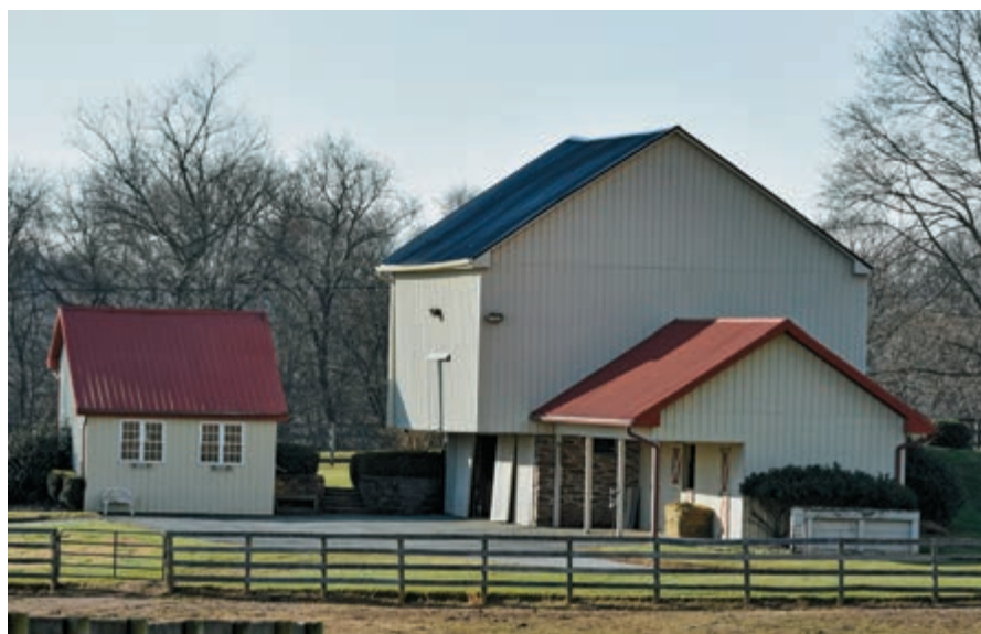
The original barn at WynOaks Farm