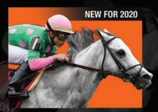
Multiple GSW and WORLD RECORD HOLDER DISCO PARTNER