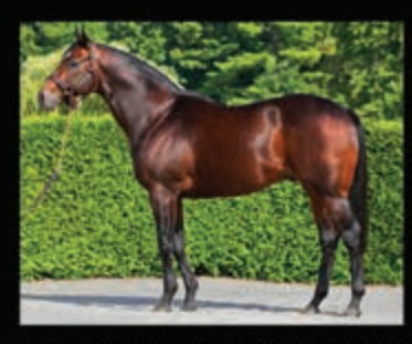
Leading Sire by GIANT'S CAUSEWAY GIANT SURPRISE

Leading New York Sire by 2YO Winners $4,000 LFSN