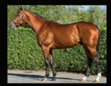
GSW/G1P by MEDAGLIA D'ORO MICROMANAGE

Leading New York Sire by 2YO Winners $4,000 LFSN