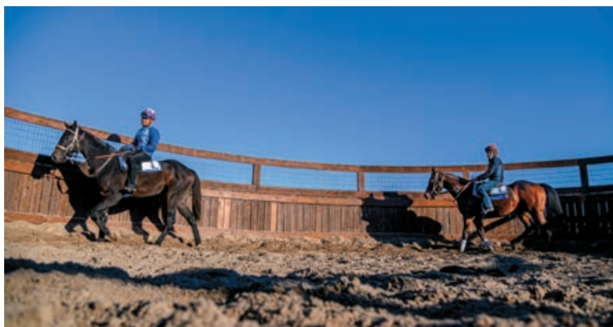
Horses in the round pen at Oak Ridge Training