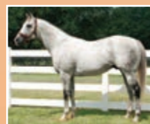
HALF OURS Unbridled's Song-Zing, by Storm Cat