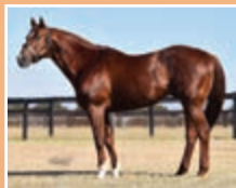
PEPPERED CAT Tabasco Cat - Morning Meadow by Meadowlake