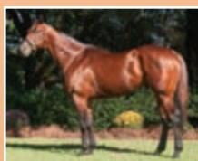
CUSTOM FOR CARLOS More Than Ready-Meadow Oaks, by Meadowlake