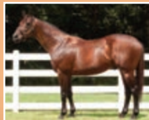
STAR GUITAR Quiet American-Minit Towinit, by Malagra