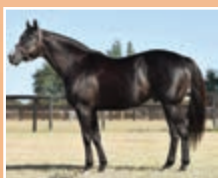
CLEARLY NOW Horse Greeley- Bend, by Arch

The staff at Clear Creek Stud takes great pride in our reputation as a top grade facility, and we are committed to the work of continuing to earn this honor.