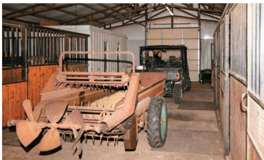
JLC Horses is a mom and pop operation

"I paid $2,700 for the stud fee, and she sold for $40,000," Curry said of the filly named Kweenkim. "She actually was an