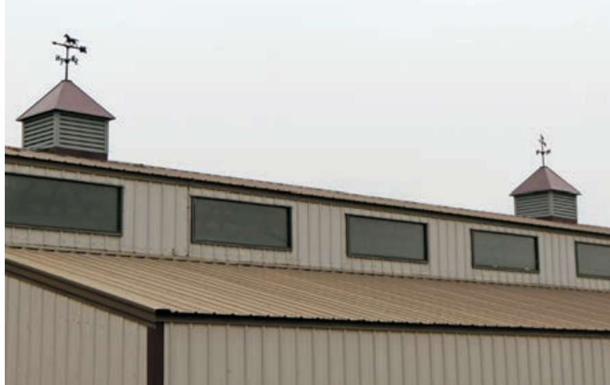
The seven-stall barn has good ventilation and natural light

Oklahoma-bred, and she has been racing in Oklahoma and Minnesota.”