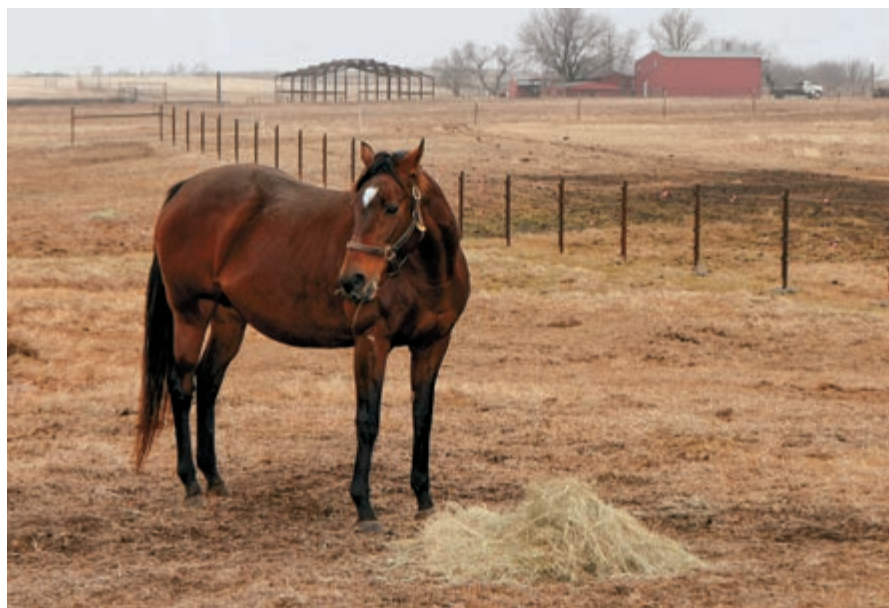
The farm is home to two yearlings, three mares, and two foals on the way