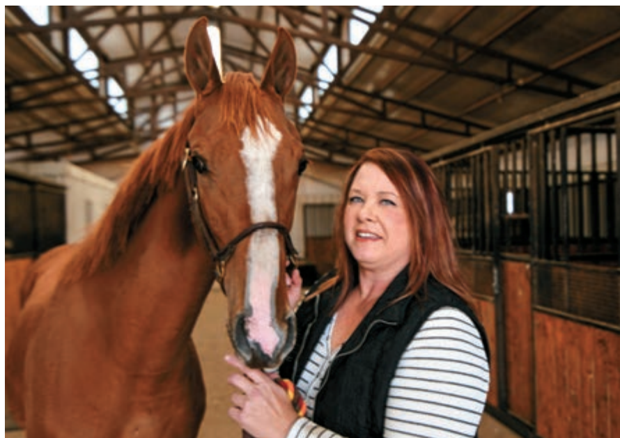
Curry enjoyed a successful year pinhooking in 2017