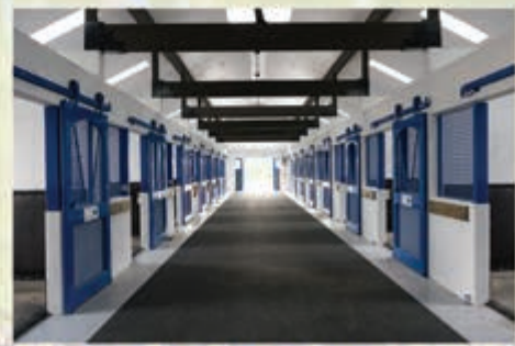
STATE OF THE ART BARN