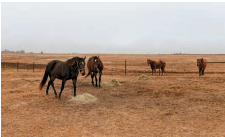
The farm sits on 22 acres near Oklahoma City and is a 45-minute drive to Remington Park

ping yearlings for sales. She traveled back and forth to Kentucky for that job and left not long before the ranch, which also has a cattle operation, sold the last of its