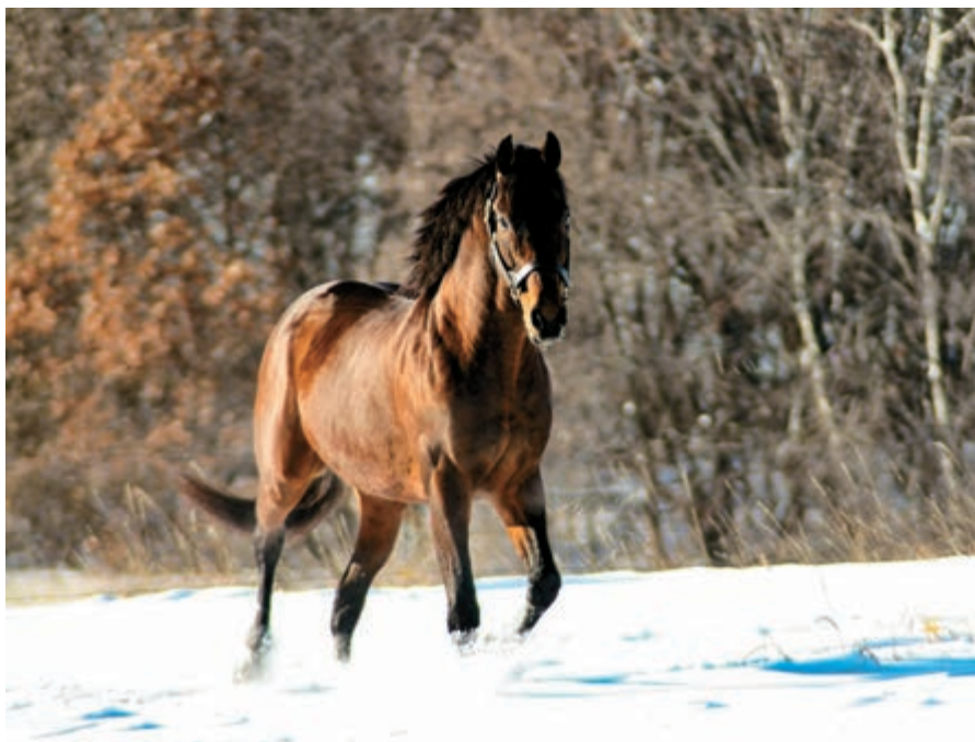
Stallion Eye of the Leopard, the 2009 Canadian champion 3-year-old male