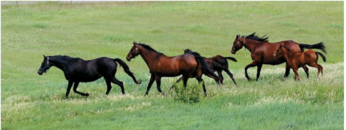
Osborne Farm is spread over 50 acres

The Osbornes bought the stallion and proceeded to purchase “seven or eight mares” to breed to him.