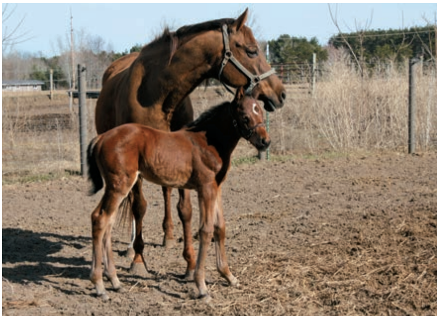
Thirty to forty horses call Osborne Farm home