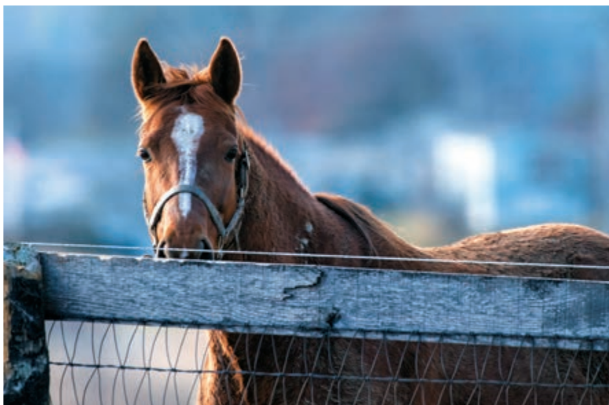
Visagie notes: 'New York's breeding program is the best in the country'