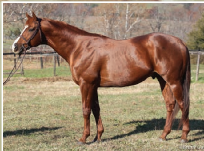
FRIEND OR FOE 2007, 16.3 h., entered stud 2013, by Friends Lake—Unbridled Star, by Unbridled

Sire of NINE winners from just ELEVEN starters , incl. Code Red ($131,746, 2nd Seeking the Ante S). A multiple stakes winner of $349,134 with 109 Beyer speed, FRIEND OR FOE is half to STAR GRAZING ($277,800), Stolen Star (dam of MG2 millionaire HIGHWAY STAR and 2019 2YO CAPTAIN BOMBASTIC ), and to the dam of SURGE OF PRIDE (G3-placed). His first four dams are all stakes horses and multiple stakes producers, including third dam MGI TAISEZ VOUS . From a family of champions.