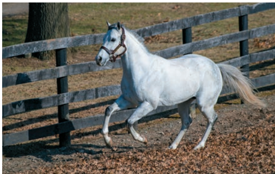
First-year stallion Disco Partner stretches his legs at Rockridge Stud