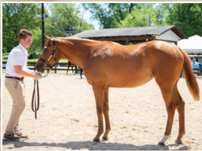
Reserve Grand Champion at the 2019 VTA Yearling Futurity Rshepherdsgait, chestnut filly by Friend Or Foe—Fancy Dancer by Citidancer

MR. BUFF, back-to-back winner of the Jazil Stakes with a 102 Beyer, his seventh stakes victory