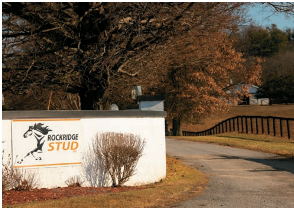
Rockridge Stud, near Hudson, N.Y., has a solid stallion roster for 2020