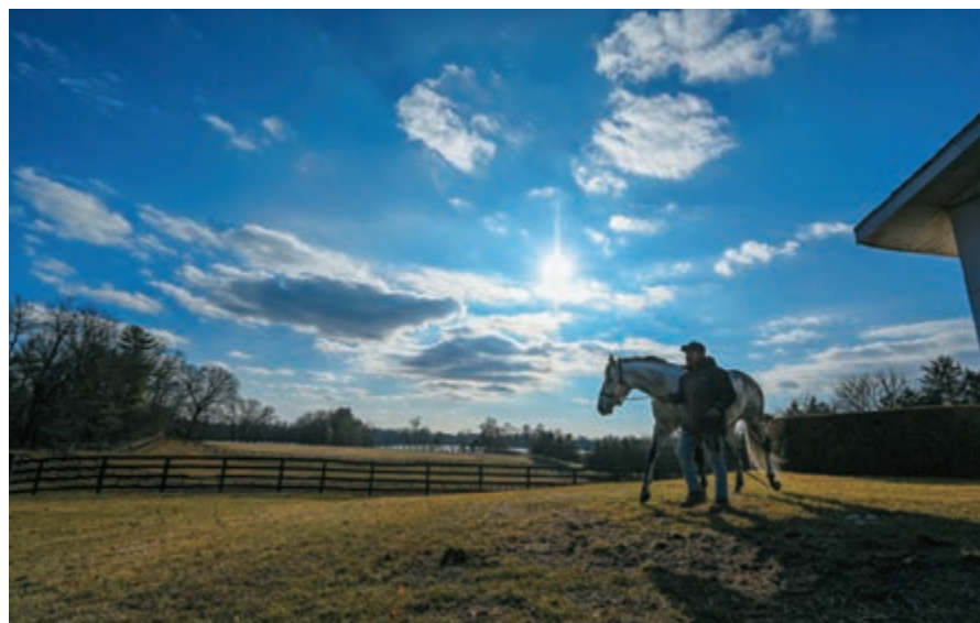
Horses enjoy spacious paddocks at Rockridge Stud