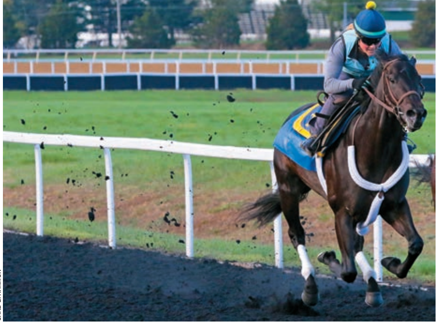
Training on the synthetic surface at Fair Hill, which is near the Pennsylvania, Delaware lines

Maryland's foal crop of 672 for 2018 is on the rise, from 660 in 2017, 650 in 2016, and 611 in 2015. The nadir was in (continued on page 62)