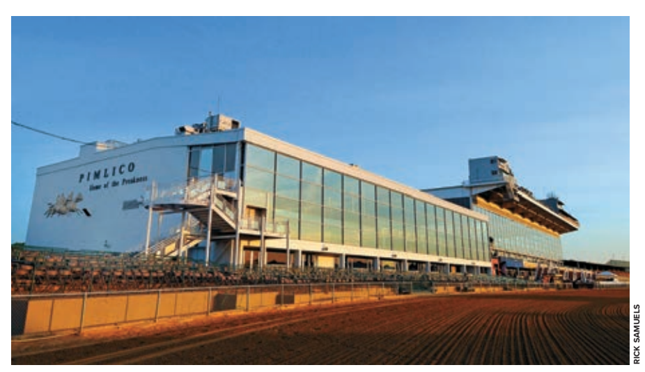
A current look at Pimlico, which is located in the Park Heights neighborhood of Baltimore

"There is a lot of excitement from the horse industry and the city. It's actually the most energized I've seen it. The city has been getting a lot of bad press for other reasons, and this gives them a chance to talk about something good that is going to happen for the city," she continued. "It's brought together a lot of unity that we haven't had in the last few years, and it's long overdue. Over time one thought these discussions would have happened quite awhile ago, but it looks like the stars have aligned.