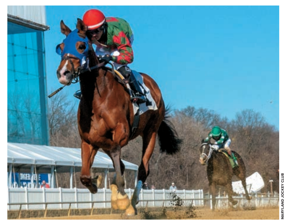
Maryland's champion 3-year-old filly Las Setas, by Seville

Graded stakes winner Blamed, the statebred champion 3-year-old filly of 2018, returned at 4 to win Gulfstream Park's Royal Delta Stakes (G3). The Sagamorecampaigned Where Paradise Lay won