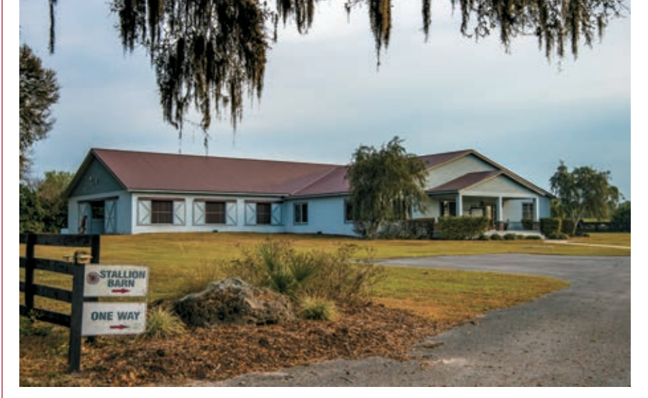
The Fernungs started Journeyman Stud in 2008

St Patrick's Day; and the initial reaction from breeders suggests their foresight is on target.