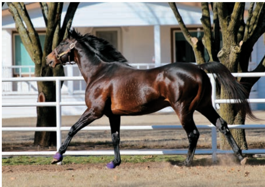
Grade 3-winning Code West covered 33 mares in his first season

"I grew up in the show horse industry but never thought I'd be in the middle of the racehorse business," said the Ohio native who now calls the Sooner State home.