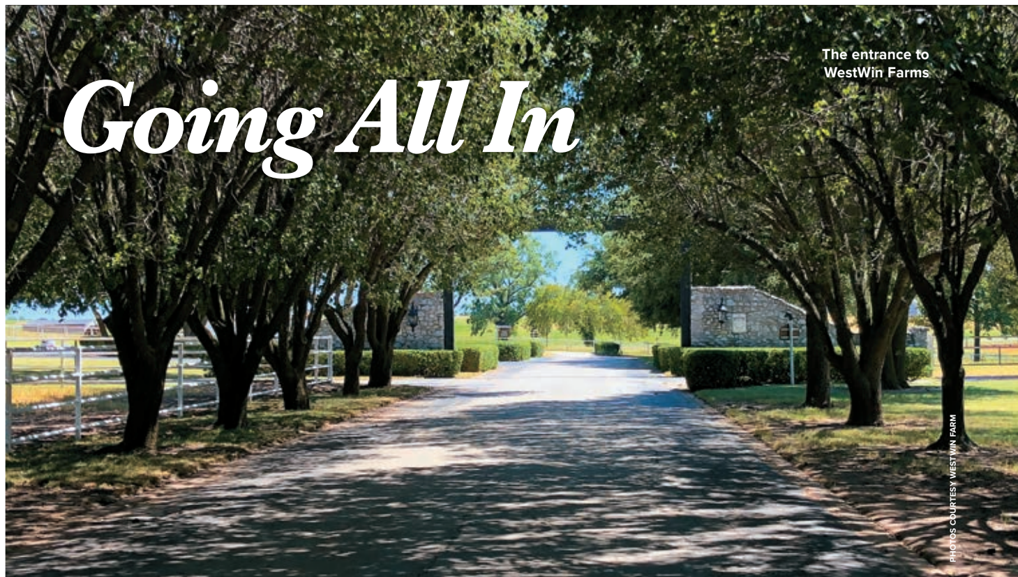
The entrance to WestWin Farms

ARIZONA ARKANSAS COLORADO KANSAS LOUISIANA MISSOURI NEW MEXICO OKLAHOMA TEXAS