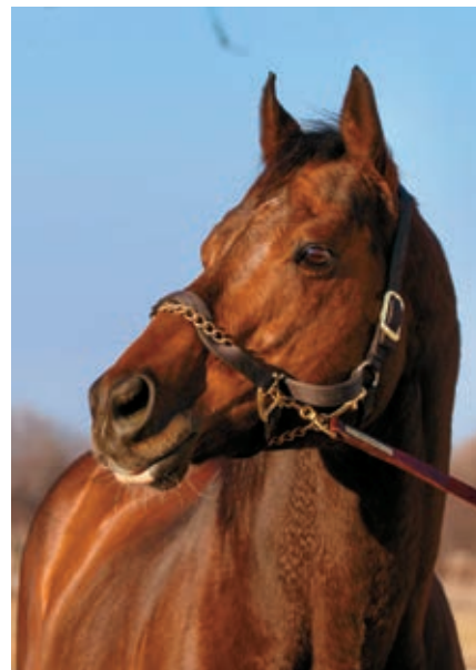
WestWin stallion Mister Lucky Cat