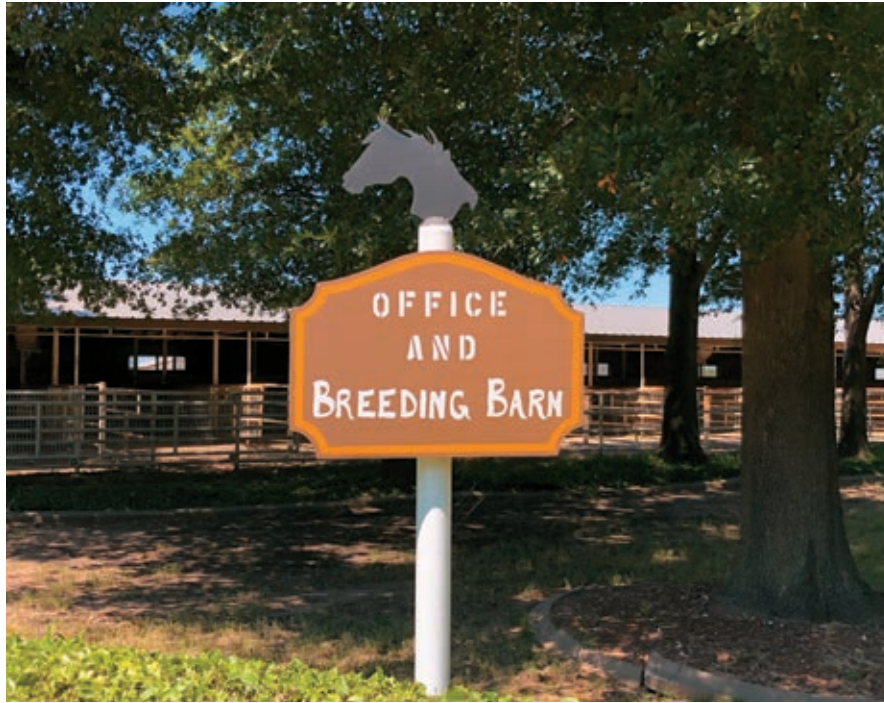
Signage at the 150-acre WestWin Farm