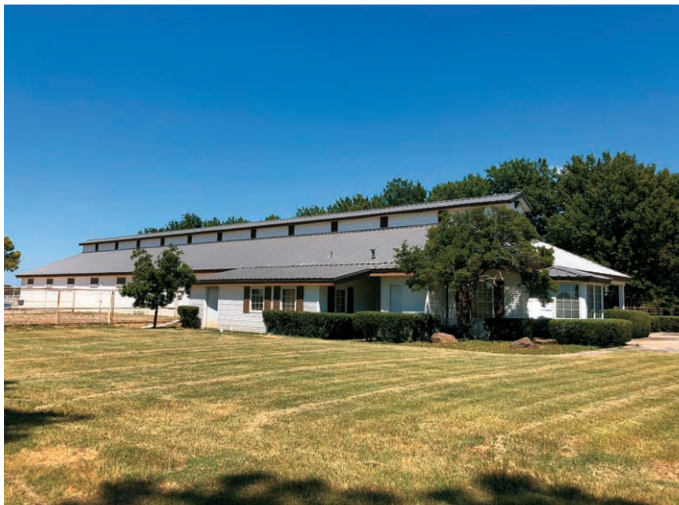
The main barn at WestWin Farm

The hand of fate again stepped in to deliver a stable manager for Hawk's new WestWin venture in the form of industry