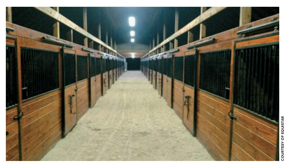
The shedrow of one of the barns at EquiStar

That "bug" has led to a small broodmare operation, a training program that