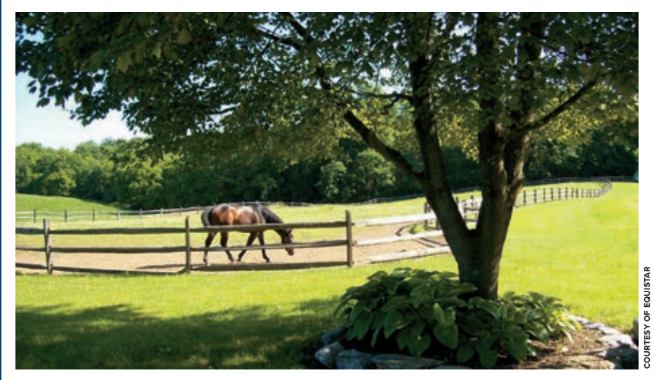
EquiStar Farm is set on 60 acres about four miles from Penn National Race Course

"We are going to try to make (our stud fees) as appealing as we can for people to try and weather the storm and just entice people to keep breeding. It's really concerning. I know I can't make a living here