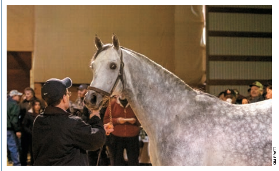
New stallion Airoforce being shown at the EquiStar stallion show

The other star of the EquiStar barn is Poseidon's Warrior, a son of Speightstown. His son Firenze Fire earned grade 1 status in the Champagne Stakes as a 2-year-old and most recently won the Feb. 15 General