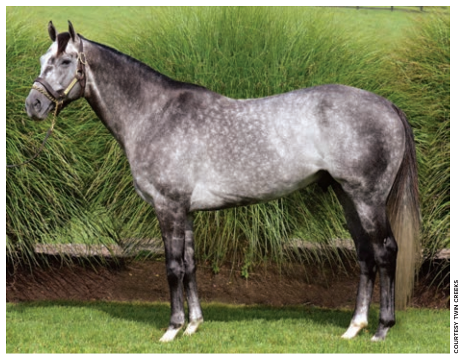
Twin Creeks Farm's Mission Impazible is among the leading sires in New York

With breeder incentives such as 30% of the purse money earned for winners by New York-bred and -sired horses, and 15% for New York-breds by out-of-state stal-