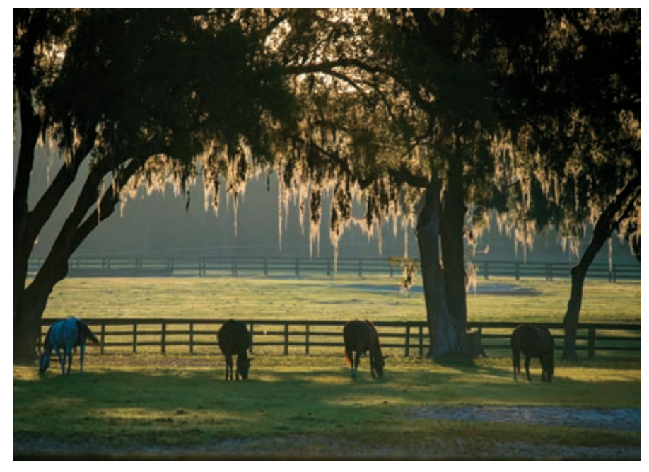
Pleasant Acres, near Morriston, Fla., spreads over 225 acres

Pleasant Acres Farm's current 225-acre location near Morriston provides the space