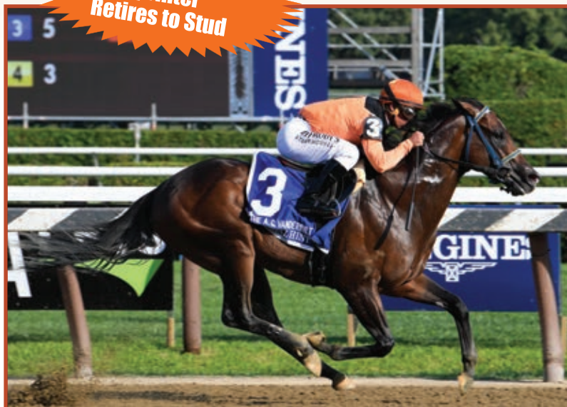
Imperial Hint Winning The G1Alfred G. Vanderbilt S.