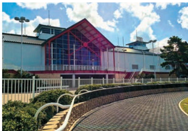
Despite COVID-related cutbacks, Sam Houston Race Park is ‘focused on racing this year’

The track's schedule will offer afternoon racing on Thursdays in January, with