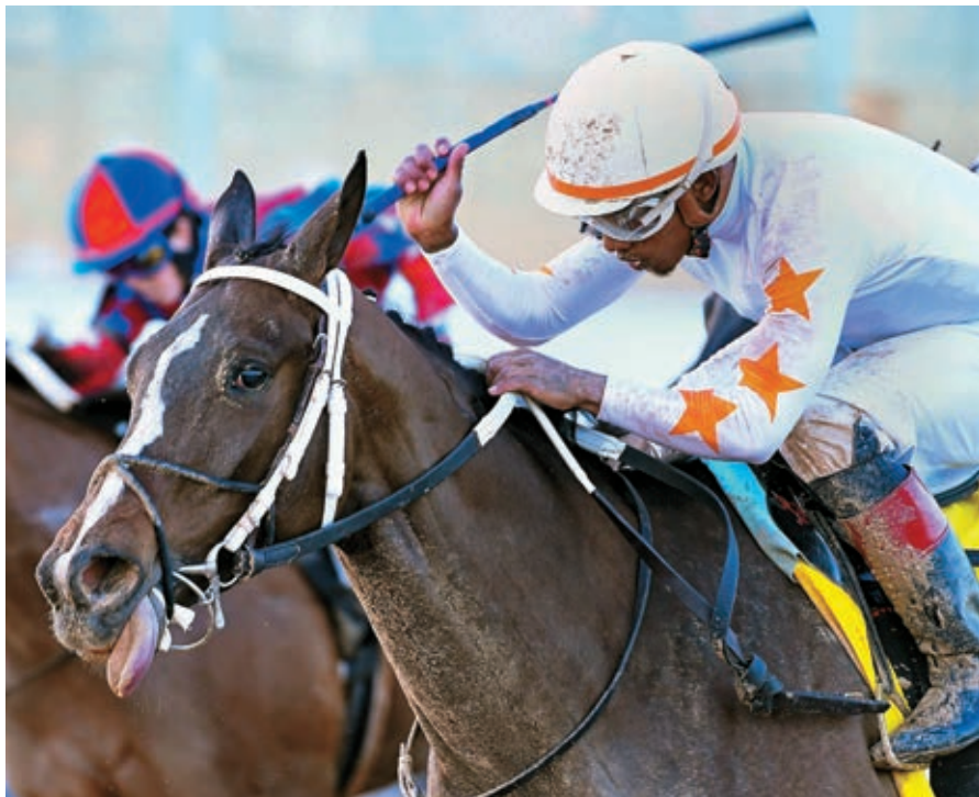
Lady Apple upset Serengeti Empress in the 2020 Houston Ladies Classic