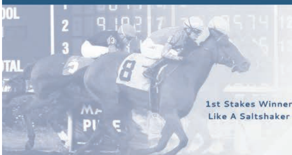
1st Stakes Winner Like A Saltshaker