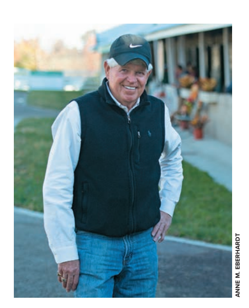
Poindexter: 'I try not to breed any of my young mares to unproven stallions'

Game for More was purchased by Albaugh Family Stables and West Point Thoroughbreds for $500,000 at this year's Fasig-Tipton selected yearlings showcase sale.