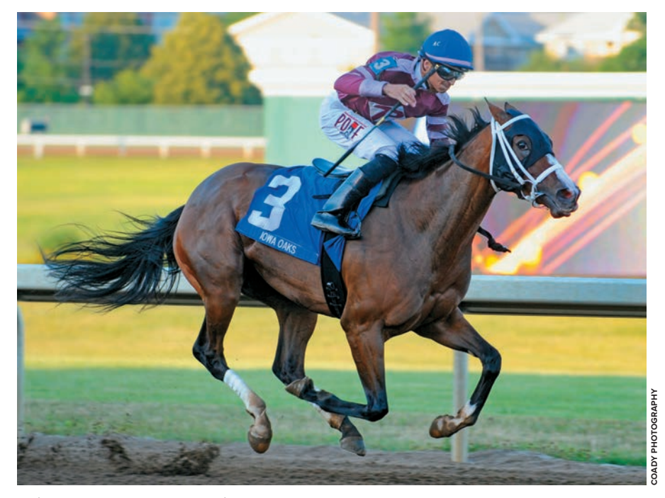
Poindexter co-bred grade 3 winner Flat Out Speed

Game for More was purchased by Albaugh Family Stables and West Point Thoroughbreds for $500,000 at this year's Fasig-Tipton selected yearlings showcase sale.