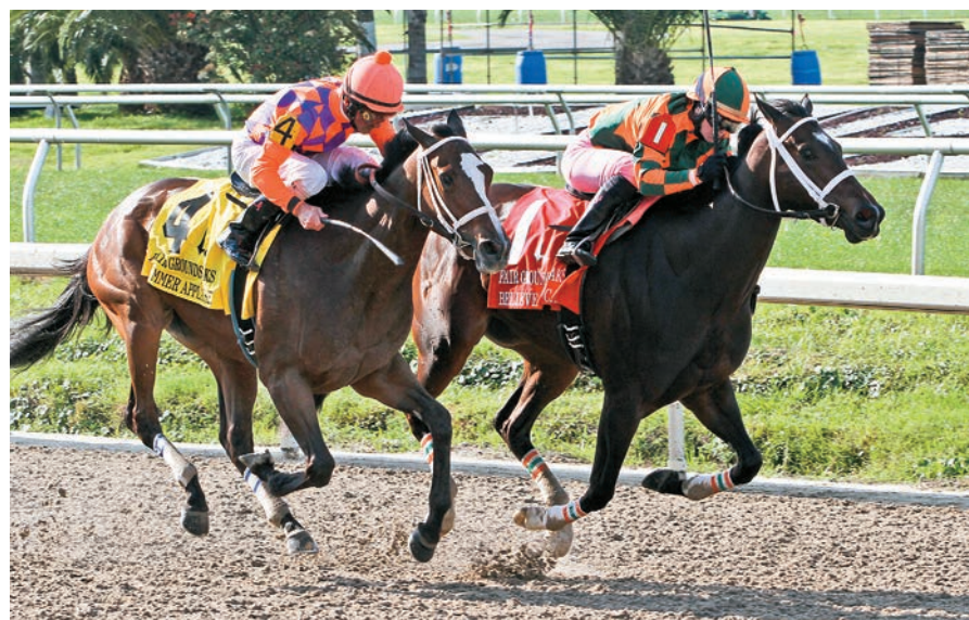
Believe You Can win the Oaks double in 2012

"Even with that, we received a great deal of criticism for entering her in the Oaks, specifically from PETA (People for the Ethical Treatment of Animals), which