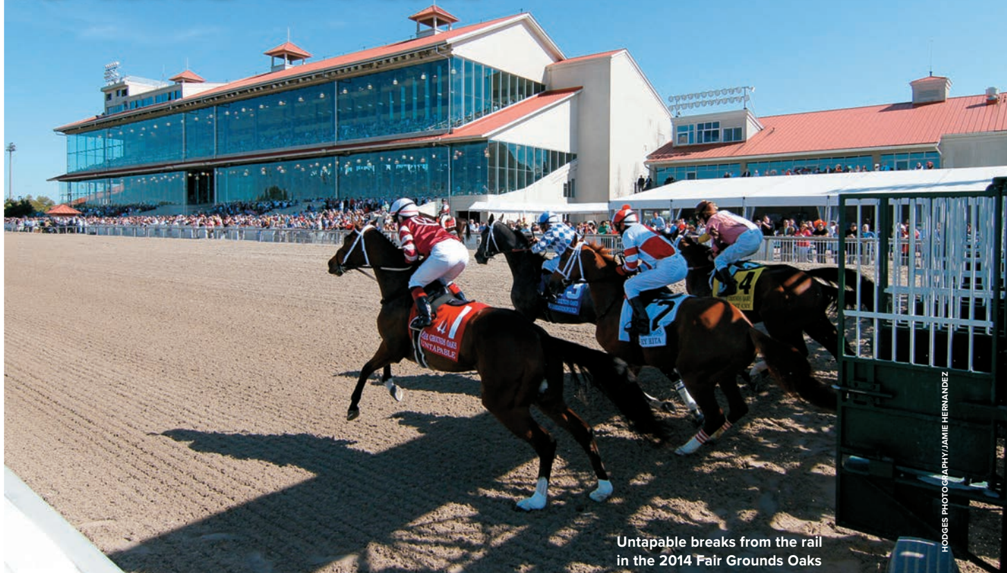
Untapable breaks from the rail in the 2014 Fair Grounds Oaks