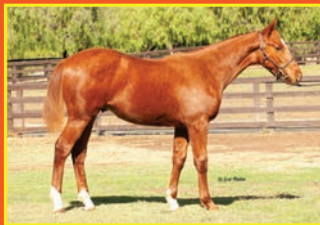
1/25/20 Ch. Colt o/o American Tribe by Tribal Rule