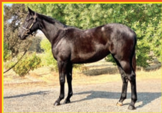
4/6/19 Dk B/Br Filly o/o Lauren's Export, by Lonhro (AUS) $47K at CA FT Oct Sale