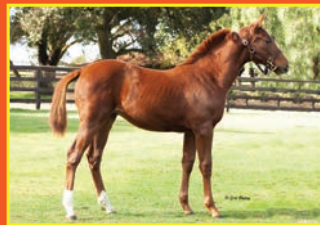
5/6/20 Ch. Colt o/o Kulinski Rose by Mud Route