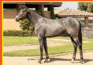
4/14/19 Gr/Rn Filly o/o Passionville, by Petionville