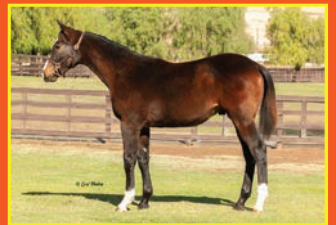
2/10/20 Db/Br Colt o/o Rockin Dorita by Rockport Harbor