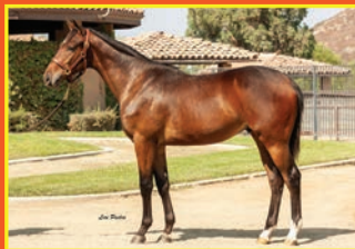
3/24/19 Bay Colt o/o Holladay Visit, by Lonhro (AUS)