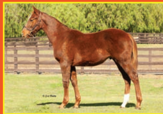
4/12/20 Ch. Colt o/o Lauren's Export by Lonhro (Aus)