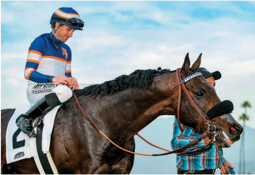
Two-time graded stakes winner Pee Wee Reese earned more than $500,000