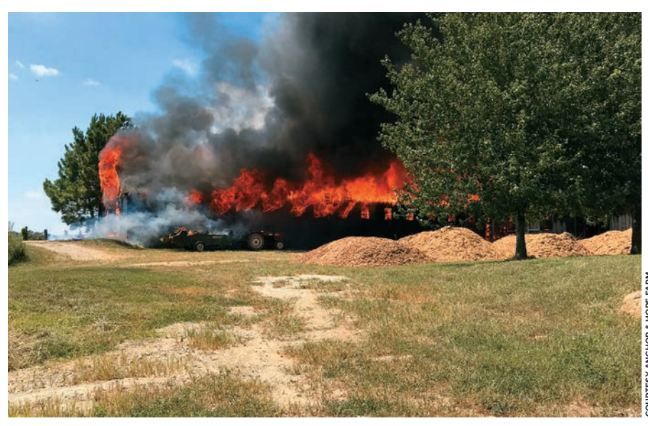
The main barn caught fire Aug. 12, 2019, and was totally engulfed within five minutes

"I have the new tack room 90% done," said Merryman in early March. "Our stallion barn was three-quarters of the way done, but the interior wasn't finished. The reason that the stallions were in the foaling barn, which was empty of mares at that time of year, was we were just gearing up