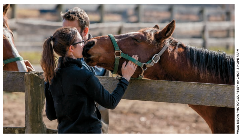
The Merrymans are trying to offer services unique to the Mid-Atlantic marketplace

"You do your best just to break even over those first several years, but you do not always break even, especially if you're carrying a lot of the mares. The whole goal for somebody like us is to at least break even until the 'kids' get to the track with the whole idea to, hopefully, start making