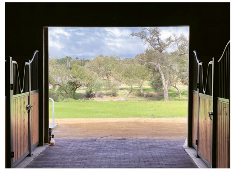
A renovated eight-stall barn on the property gives the farm flexibility as stalls have removable panels to convert the space into larger foaling stalls