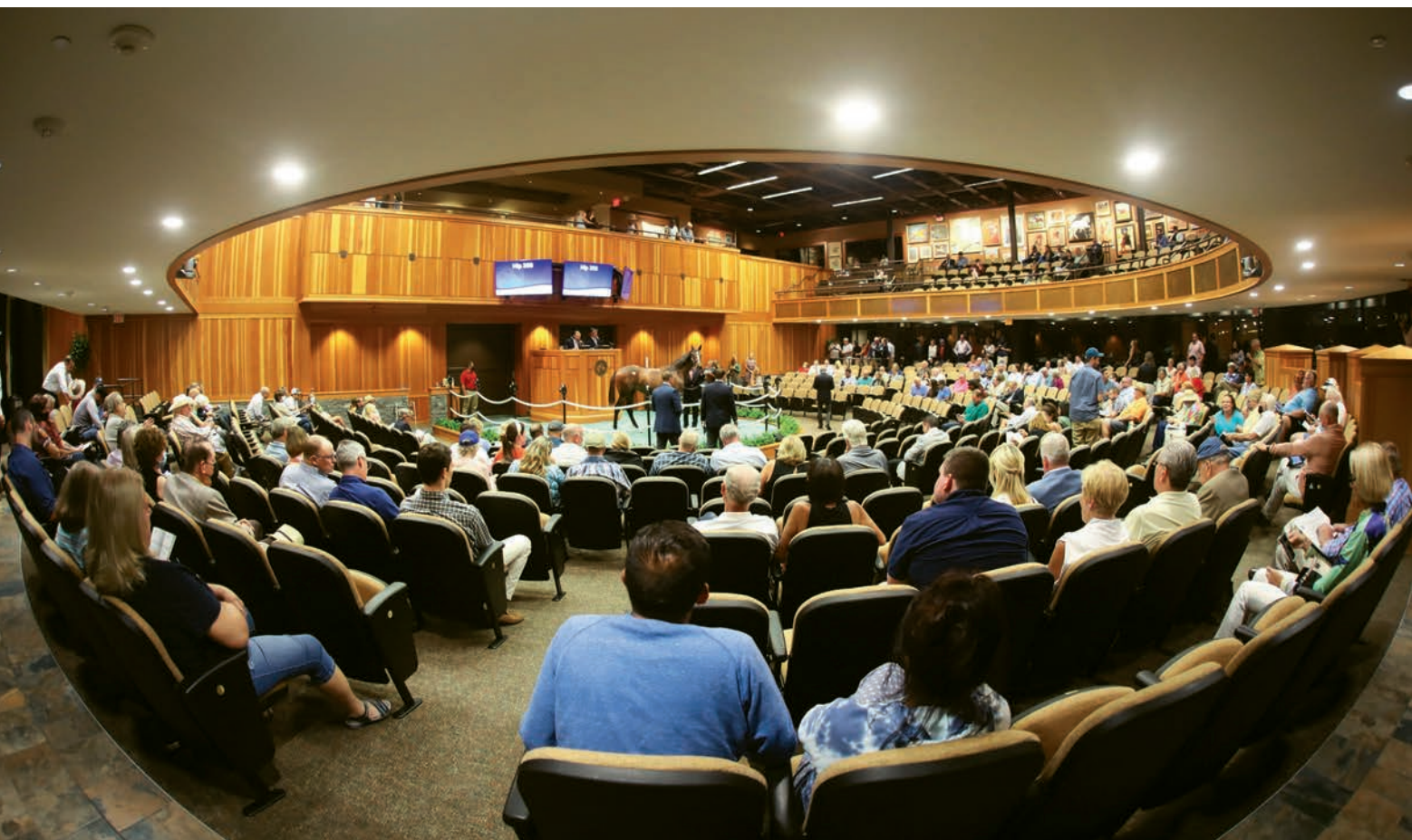
A bounce-back year at the Fasig-Tipton sale of New York-breds in mid-August helped ease concerns