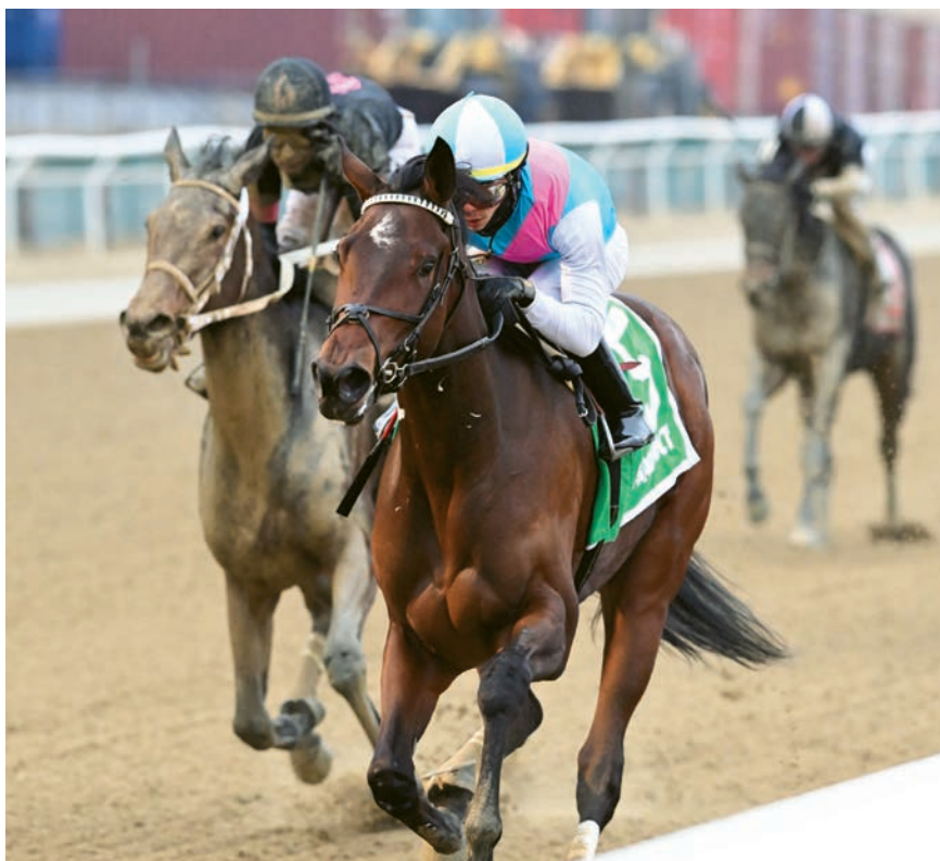
Above, Geno, in the Great White Way, and, below, Yo Cuz, in the Fifth Avenue, captured lucrative divisions of the New York Stallion Stakes Series Dec. 18 at Aqueduct