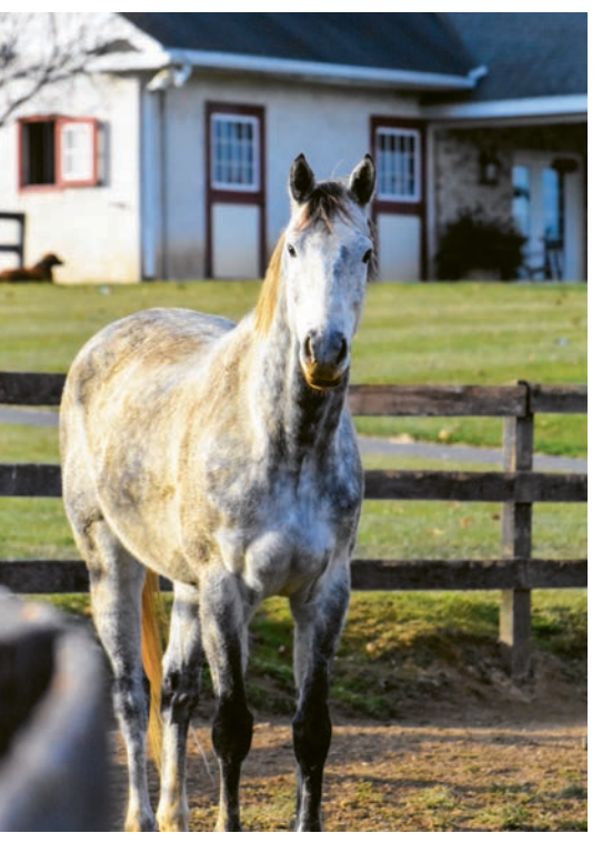
Super Buddy is a riding horse at GreenMount Farm; Stall 3 always will be a special place at the farm