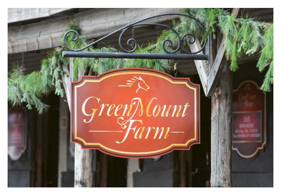
The Moores launched GreenMount Farm after purchasing 43 acres near Glyndon, Md.

chronicle an incredible journey. Commercial breeders that they are, the Moores sold Knicks Go as a weanling. Tail-end of the sale, Hip 3,368, the handy-looking gray colt brought $40,000 at the 2016 Keeneland November mixed sale.