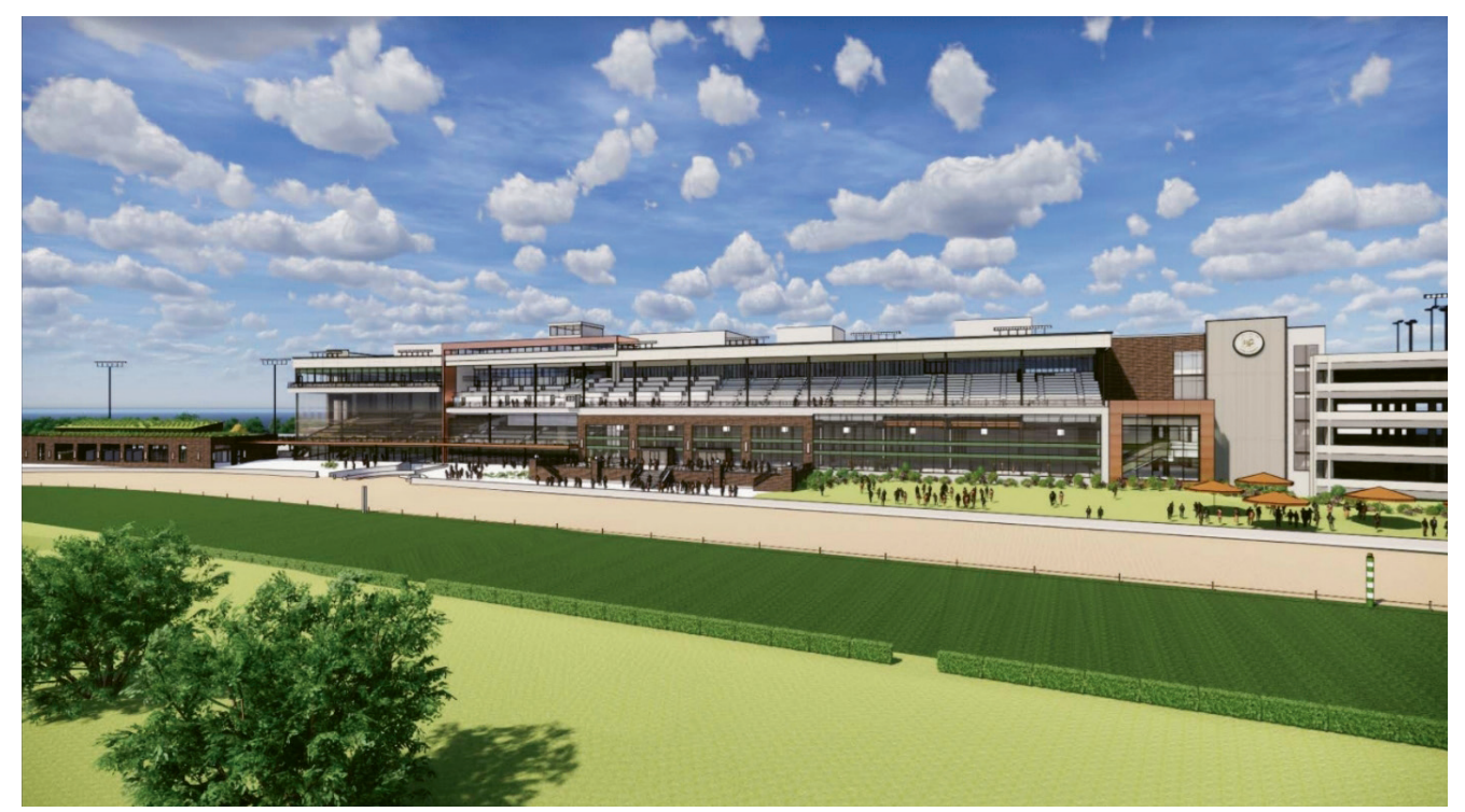
An artist's rendering of a new Hawthorne Race Course that would include a casino provides a vision of how the Illinois industry could begin to rebound

owners are eligible for bonuses when an Illinois-bred wins either an open or a restricted race.