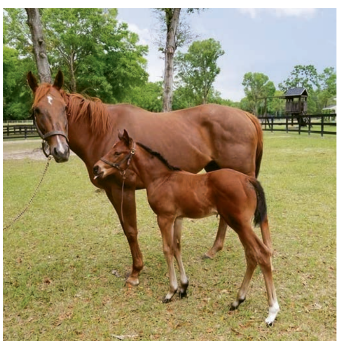
Lady Shipman and Golden Pal in 2018 at Barbazon Racing & Bloodstock near Ocala, Fla.