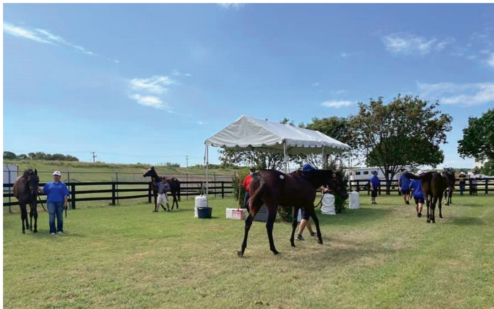
Last year's Texas 2-year-olds in training sale in April produced some eye-catching numbers

and Quarter Horse racing history, and I think the future is very bright for breeding and racing here," Collin-