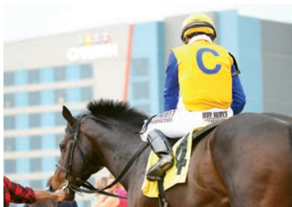
With Oaklawn Park's lucrative stakes for Arkansas-breds in races such as the Nodouble Breeders' and Downthedustyroad Breeders' stakes, which this year offered purses of $150,000 each, competition can be stiff (pictured are 2021 editions of these races where Tempt Fate won the Nodouble and The Mary Rose won the Downthedustyroad (at right)

sell. Obviously, at Oaklawn, if they end up being a maiden claimer, they'll end up getting sold anyway. If I had 1,500 acres, you could probably get away with that. But 50 acres, you're almost having to kind of build your own race horse. It's impossible to go buy a good Arkie-bred. They're not going to run them for a tag. Nobody's going to sell them because they're so valuable. If you go to the Texas sale, which is really the only place you can get them, well, that's a crap shoot. If you really want to race at Oaklawn, they run these Arkie-breds every weekend, you're going to have to build your own." BH