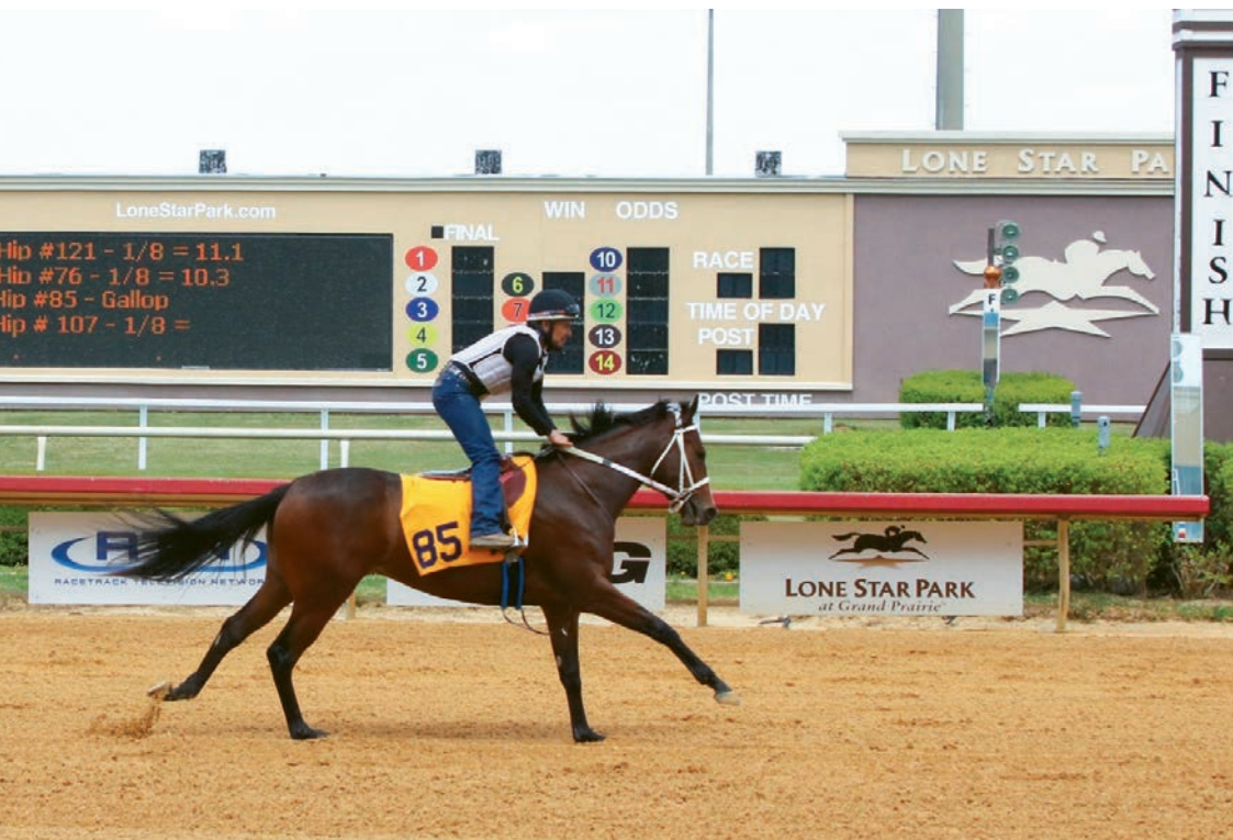
Juvenile filly The Reese Beast, who would prove to be the sale-topper at $240,000, breezes at Lone Star Park ahead of what would be a very successful Texas Thoroughbred Association 2-year-olds in training sale

which last year was affected by cancelled race days and limited attendance. While that money hasn't seen a big increase, Ruyle is hopeful it will as wagering ramps up on improved Texas racing.