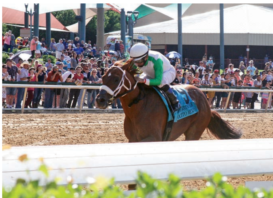
Fans pack Lone Star Park, one of three major tracks opened in Texas during the 1990s

when Lone Star Park hosted the 2004 Breeders' Cup, but Texas has seen a steady decline in breeding activity and purses since then, as the tracks and state-bred programs in surrounding