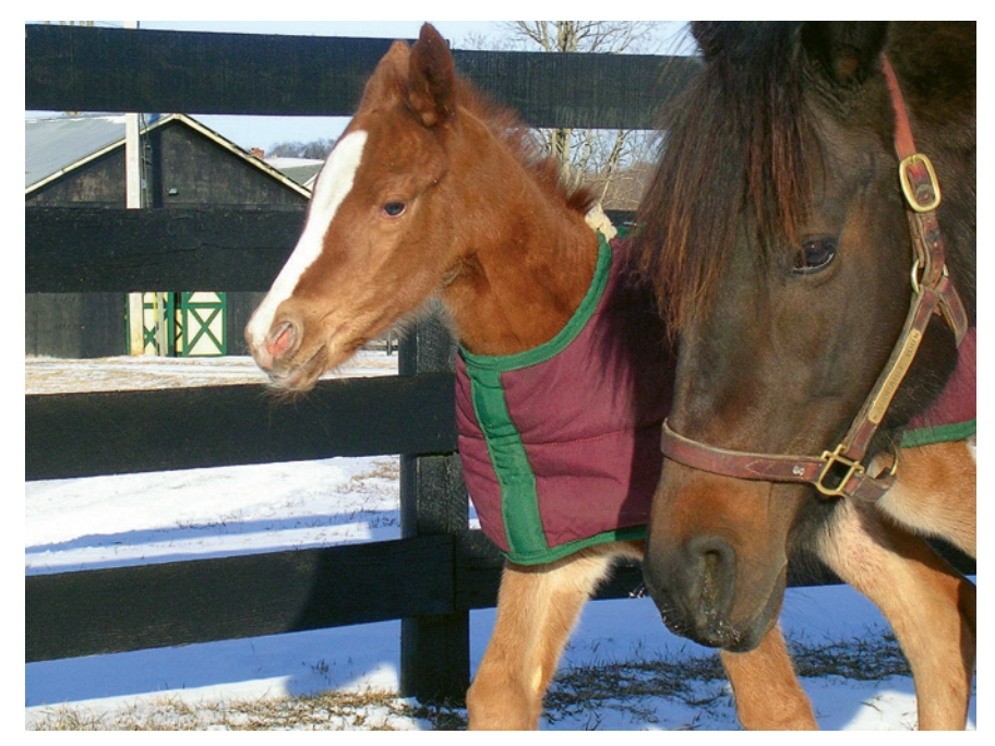
Carameaway as a foal in 2020, with her dam Adorable You