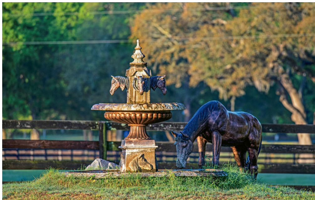
Pleasant Acres is home to more than 200 resident horses, including stallions and boarders, and foals more than 100 mares a year

"This business is very relationship-oriented. At least five of the stallions who are here now were all referrals,"