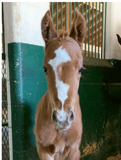
In January 2022, Pleasant Acres welcomed the first foal for Curlin’s Honor, a filly out of Be All You Can Be, by War Front, from the family of grade 1 winners War Flag and Civil Union

Pleasant Acres has become known for its annual stallion show, which it has hosted every January since 2014. The 2023 event is scheduled Jan. 7. The invitation-only event targets owners and breeders.