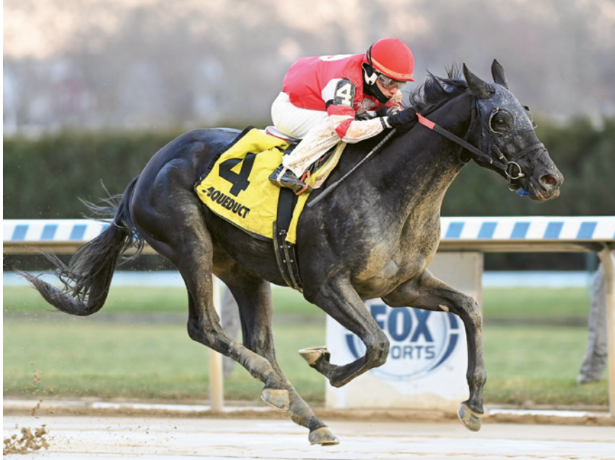
Seacoast Thoroughbreds of New England homebred General Banker entered the Fifth Avenue as a maiden before romping to his first win and first stakes win