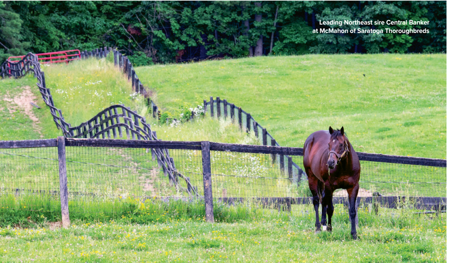
Leading Northeast sire Central Banker at McMahon of Saratoga Thoroughbreds